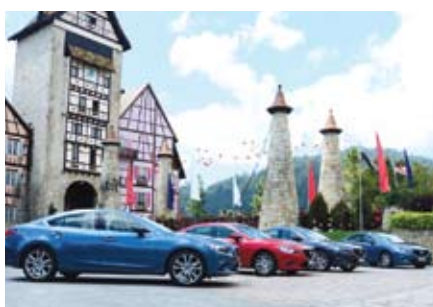
The all-new Mazda6.