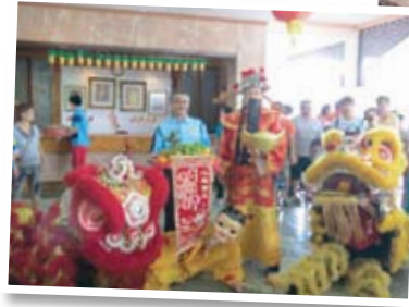
Photo opportunity with the lions, "Laughing Buddha" and the "God of Prosperity".

"Laughing Buddha" and "God of Prosperity" made an appearance too and gave away "angpoo" and goodies to the crowd. The acrobatic lion dance performance really brought cheer to everyone.