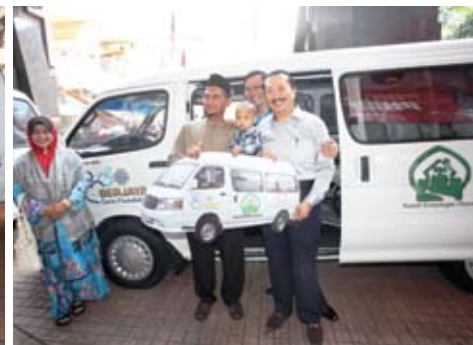
Berjaya contributed a total of 36 vans and 1 truck to various NGOs.