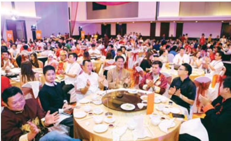
U Mobile dealers from various parts of Malaysia soaking up the 'U Kingdom' theme with a befitting meal and great performances.