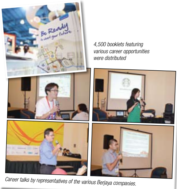
4,500 booklets featuring various career opportunities were distributed