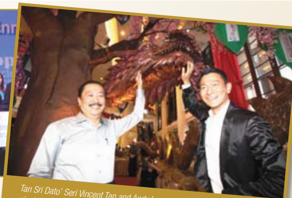
Tan Sri Dato' Seri Vincent Tan and Andy Lau with the 130-foot long giant dragon cake, made by Berjaya Hotels and Resorts