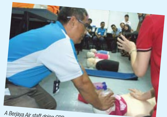
A Berjaya Air staff doing CPR on a dummy.