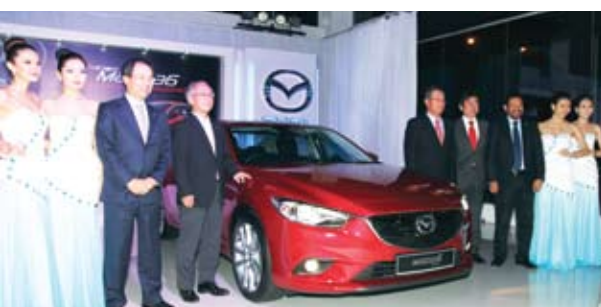
The launch of all-new Mazda6

Prior to this, a media test drive was held at Bukit Tinggi from 29 to 31 January 2013. The vehicle is priced between RM155,159 and RM188,648, depending on the variant.