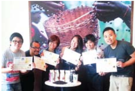
Media friends and their certificates.