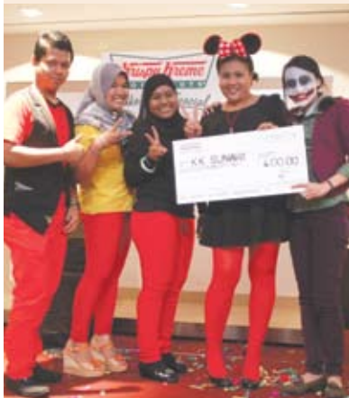
Krispy Kreme Sunway Pyramid receiving a token for achieving their Halloween Promotion sales target.