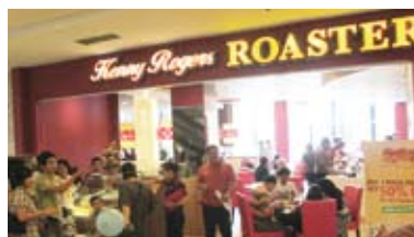
KRR restaurant at Botani Square.

KRR offered promotions such as "Buy 1 Free 1 Kenny's Quarter Meal" and "50% Discount on Kenny's Quarter Meal with every Kenny's Quarter Meal purchased, during the opening of all 3 restaurants.