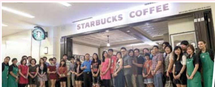
A group photo of all 15 couples and Starbucks partners at Starbucks Straits Quay.