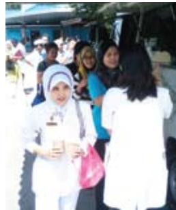
Hospital staff and patients queuing up for their Frappuccinos to quench their thirst on a hot sunny day.

Starbucks' media friends learnt the right method to brew coffee with a coffee press following basic steps as well as obtained a better understanding of the fundamentals of proportion, grind, water and freshness. The enthusiastic students were also taught the precise approach of enjoying coffee aroma, tasting, comparing and food pairing. The group received a certificate each from Starbucks Coffee Malaysia at the end of the session.