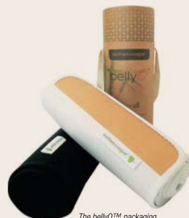
The belly0™ packaging

belly0™ is priced at RM209 and is now available in stores and online.