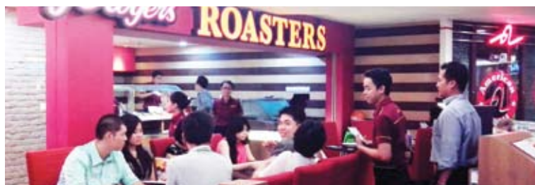
KRR restaurant at Tunjungan Plaza 3, Surabaya.