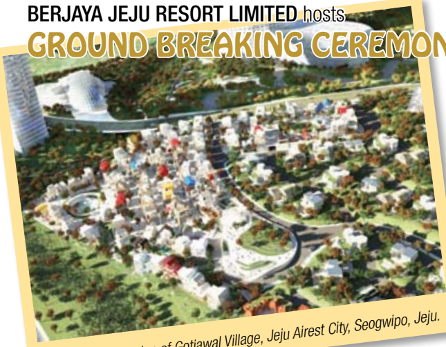
Artist's impression of Gotjawal Village, Jeju Airst City, Seogwipo, Jeju.