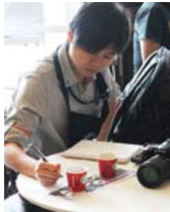
One of Starbucks' media friends taking notes during class.