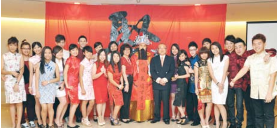
The organizing committee.