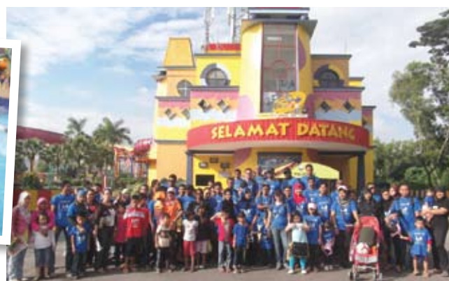
Management and staff of Securexpress had a great time with their family members.