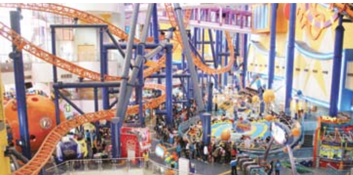
The Berjaya Times Square Theme Park was popular with the crowd with long queues for the various rides.