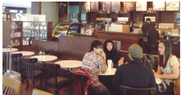
The look and feel of the Starbucks outlet at Penang International Airport.

The media proceeded to a luncheon, a shopping spree around famous markets in Penang and then, a pit stop at Starbucks Penang International Airport for a Frappuccino to-go before departing to Kuala Lumpur.