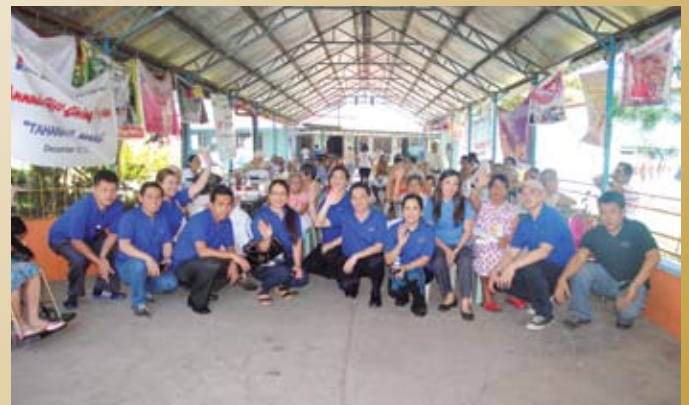
Berjaya Makati Hotel staff and management with the old folks.