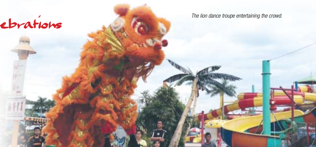
The lion dance troupe entertaining the crowd.

On 16 February 2013, Desa WaterPark welcomed the Lunar New Year with a spectacular performance by an acrobatic Lion Dance Troupe. The lion dancers enthralled children and adults alike with their majestic demeanor.