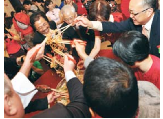
The traditional 'Lou Sang' ritual to bring good luck and blessing for the year.