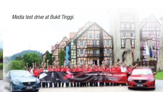
Media test drive at Bukit Tinggi.