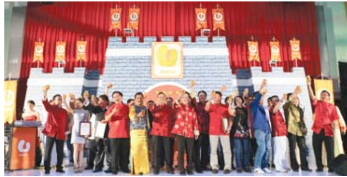
We thank you! - A toast to prosperity from U Mobile's Management and dealer friends.

U Mobile's business associates from various regions in Malaysia were treated to a scrumptious meal and great performances. The event ended with a toast to prosperity by the U Mobile management.