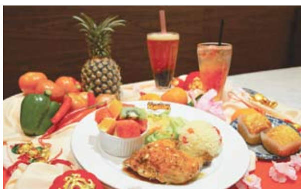
The KRR Golden Fortune Chicken, Passion Tea and Jelly O'Berry.