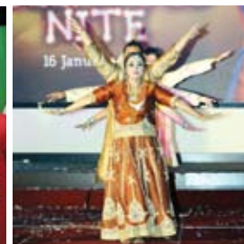
A dance routine for the ROASTERS Colours of the Night Challenge which is a talent competition among the staff.