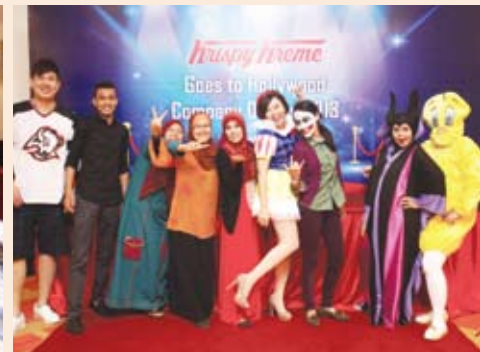
Berjaya Krispy Kreme Doughnuts' management team.

On 17 February 2013, Berjaya Krispy Kreme Doughnuts Sdn Bhd had their inaugural company dinner which was attended by 80 employees. The theme was "Krispy Kreme Malaysia Goes To Hollywood" and employees went to great lengths to vie for the best dressed award by turning up in their fanciest Hollywood outfits.