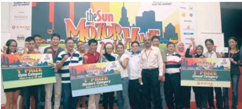
The winning teams of all three categories.

3rd: 4 Sunny Gals (theSun) Prize: 4 x Samsung Galaxy Tab2 7.0