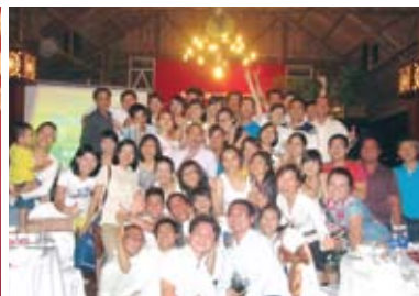
All staff had fun at the dinner gathering.