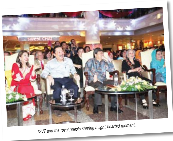
TSVT and the royal guests sharing a light-hearted moment.