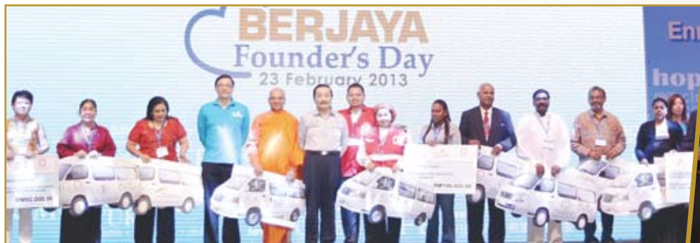
Tan Sri Dato' Seri Vincent Tan and Dato' Robin Tan with the various beneficiaries on the 3rd Berjaya Founder's Day.