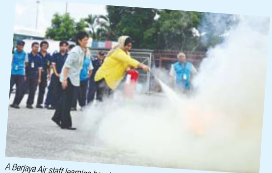
A Berjaya Air staff learning how to operate a fire extinguisher.

As part of its on-going training programmes to improve staff capabilities, Berjaya Air organised a hands-on training session for its staff in First Aid and also on how to use a fire extinguisher.