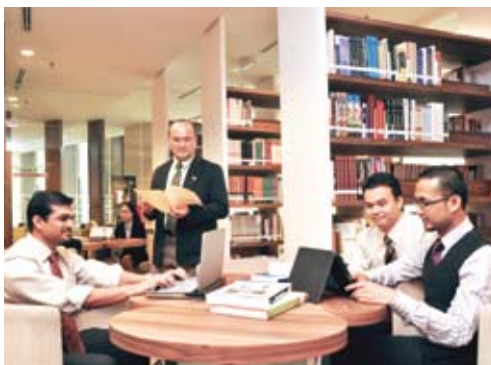
Choosing qualitative or quantitative research methodologies for MBA coursework.

BERJAYA UCH recently introduces its newest programme, the Master of Business Administration (MBA). The BERJAYA MBA programme is a 1 year course designed to introduce students to the various disciplines in business and management. It also features specializations in International Business, International Hospitality, and International Tourism.