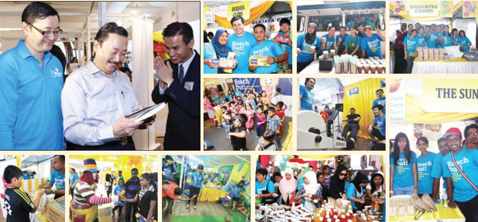
Food, fun and games were the order of the day at the various games booths and Kiddy Zone on the 10th Floor, and food stalls at Ground Floor Boulevard.