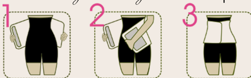
How to put on the belly0™