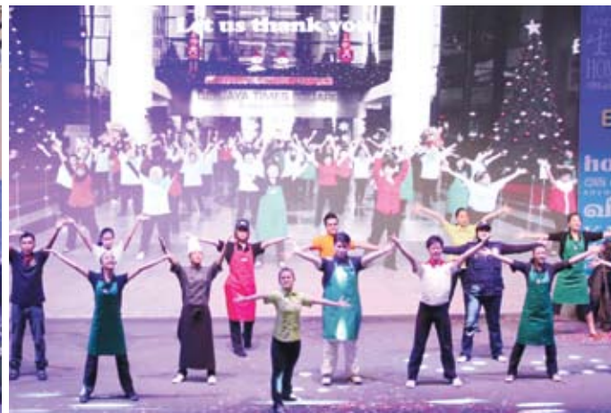
There were a variety of performances at the launch of the 3rd Berjaya Founder's Day.