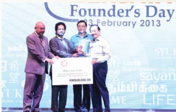
Better Malaysia Foundation Person of the Year 2013 award winner, Mercy Malaysia, received RM500,000 cash from TSVT

and abroad. Mercy Malaysia has been actively involved in providing emergency assistance and humanitarian services to affected populations since 1999 and is present in more than 20 countries worldwide. As a recipient of the Award, Mercy Malaysia also received RM500,000 cash from TSVT. This was the second year the award was presented to honour an individual or organisation for their excellence in commitment and dedication towards supporting and providing assistance to the less fortunate communities.