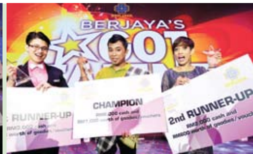
The top 3 prize winners of the Berjaya's Got Talent Contest.