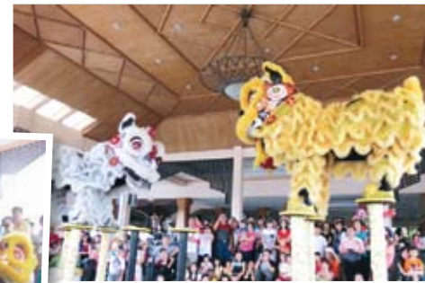
The crowd was mesmerized by the stunning acrobatic performance.