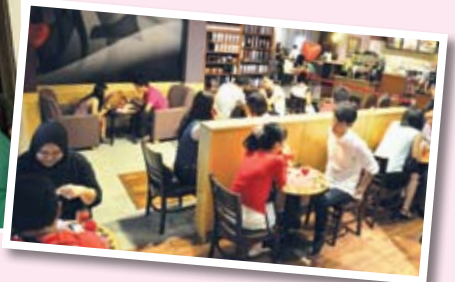
The lovely couples enjoying their dinner at Starbucks Jaya One.

In conjunction of Valentine's Day, Starbucks collaborated with Foodsion Magazine to celebrate love by hosting two Valentine Dinners for readers and digital fans.