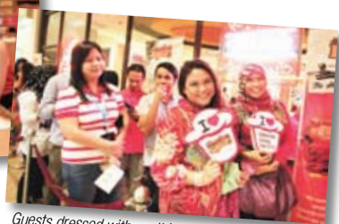
Guests dressed with anything red queuing for RED event.