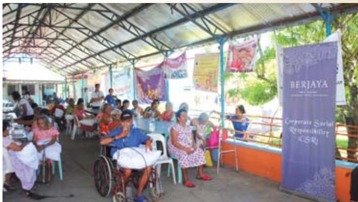
The old folks at Tahanan ni Maria.

The hotel's visit to the nursing home is part of the company's CSR programme, which also includes feeding programmes to depressed communities and disaster areas, and community clean-up drives.