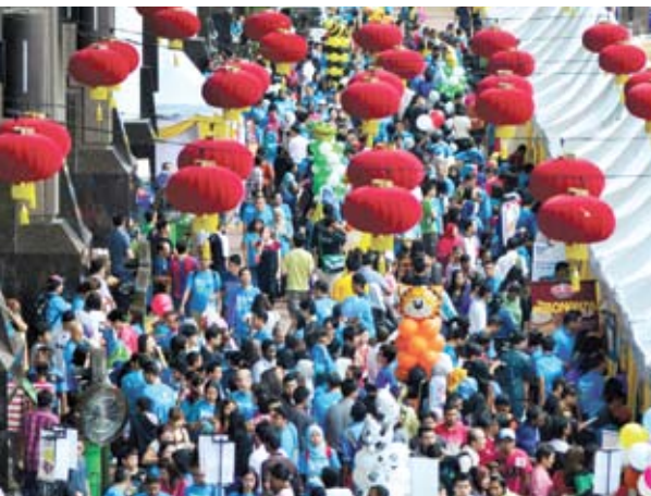
About 20,000 Berjaya staff and their families enjoyed the family day carnival at Berjaya Times Square.