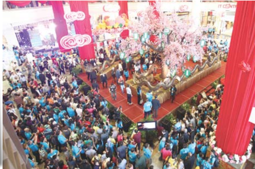
The 130-foot long dragon cake took centre stage at the main entrance of Berjaya Times Square.