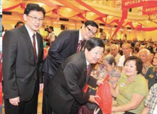
Senior folks waiting to receive their hampers and ang pows at the The KL & Selangor Chinese Assembly Hall.