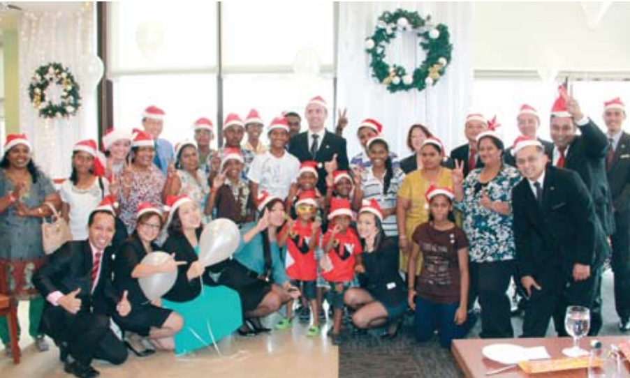
A group picture of Berjaya Times Square Hotel HODs and staff and the children.