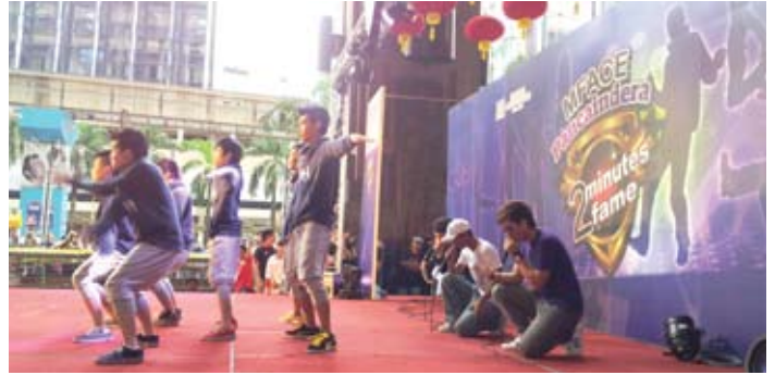
Performers showcasing their talent to bag the top spot.

27 January 2013 - "2 Minutes 2 Fame" is a search for a localized genuine talent to showcase their various talents. This is the Battle Round Stage Final where the previous contestants come back and competed for the remaining 5 spots to compete in the Grand Finale at Genting.