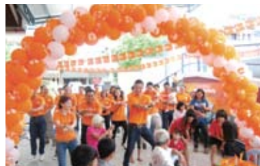
The children and elderly enjoyed themselves with the Gangnam style dance with our U Buddies.