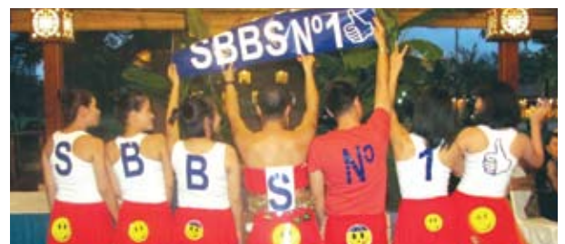
Staff from Brokerage Department bagged the best team performance.

On 14 December 2012, SaigonBank Berjaya Securities JSC ("SBBS") organized a simple staff get-together dinner. Despite the tough economic challenge faced in Vietnam, SBBS had improved its market share by 82% compared to year 2011. Several awards were given to reward staff. There were also staff performances which showcased the staff talents. Team morale was high and all the staff pledged to increase SBBS' market share even further in year 2013.