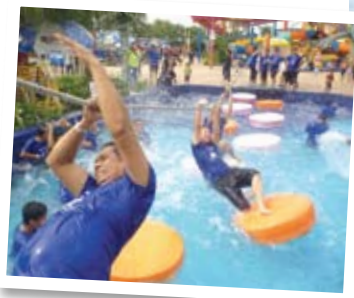
Tarzan is coming! Participating staff raced it through the water in Tarzan's style.

The thrills and spills of the family day at the water theme park left everyone physically drained at the end of the day but all were mentally motivated as being part of a big happy Berjaya family.