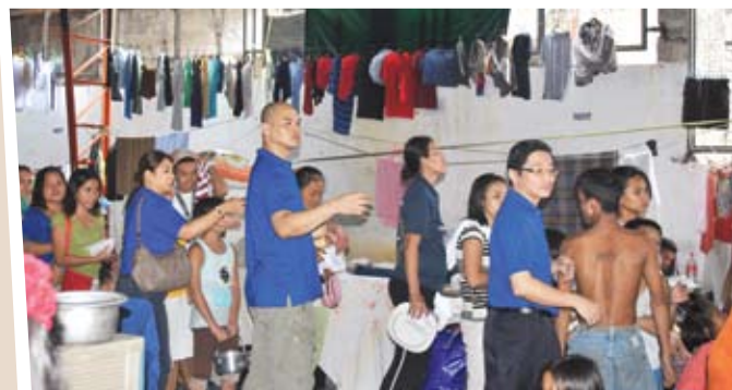
Berjaya Makati Hotel volunteers (in blue) helping out with the food distribution.

The feeding programme is one of the numerous projects under Berjaya Makati Hotel's CSR programme.