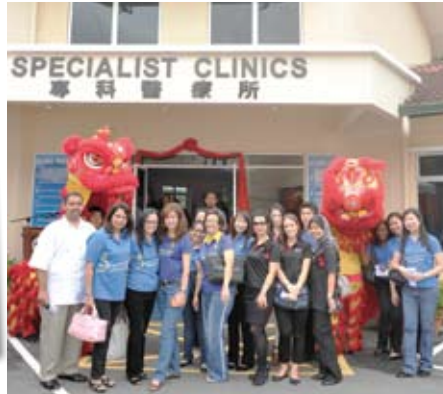
Berjaya senior management and staff at the Tan Lam Hui Block at NSCMH Medical Centre.