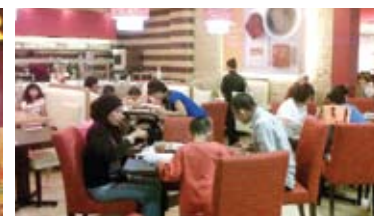
KRR restaurant at Cibubur Junction.