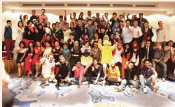
Berjaya Krispy Kreme Doughnuts' management and team members.