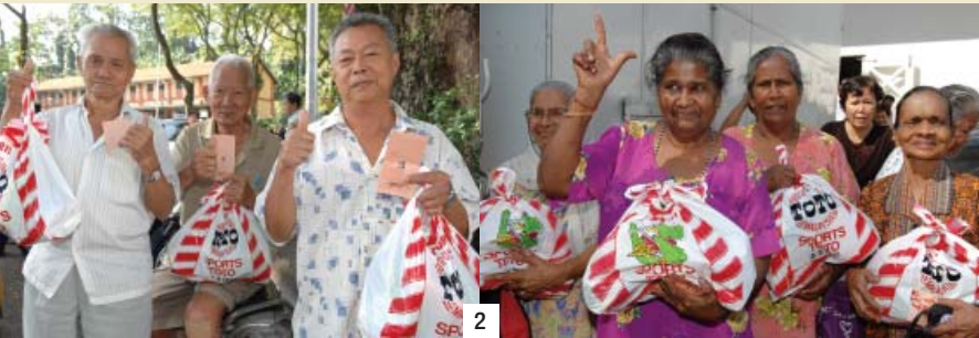
2. Recipients of this year's Chinese New Year mini hampers and ang pows

contributions not only to the Chinese community but also to those in need from other races including the indigenous communities in East Malaysia, in line with the 1Malaysia spirit.