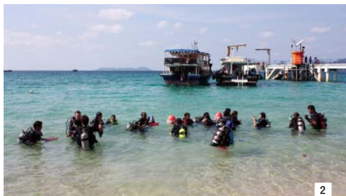
1. The Berjaya Tioman Reef Clean-Up team. 2. Divers preparing for the underwater clean-up.