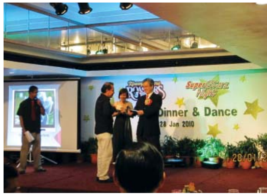
Superstarz Grand Draw Winner.

KRR held its Annual Dinner & Dance 2010, themed "Superstarz Night" at Kelab Darul Ehsan, Ampang Jaya on 28 January 2010. It was indeed an entertaining celebration which included a dance competition and lucky draw as part of the night's festivities.