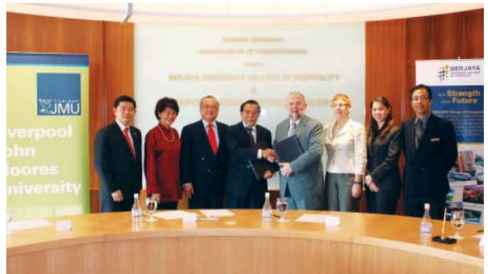
Two education giants- Berjaya University College of Hospitality and Liverpool John Moores University.