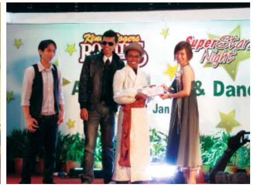
Winner of the Dance Challenge.