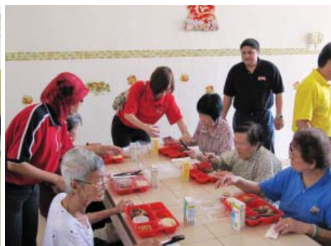
Enjoying a sumptuous KRR meal.