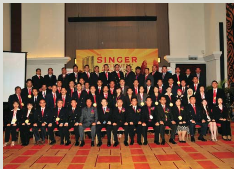
SINGER sales achievers at the SINGER Sales Convention 2010.

Among the highlights of the sales convention was an awards presentation to the achievers in recognition of their continuous support and dedicated service. An annual dinner was also held after the award presentation.