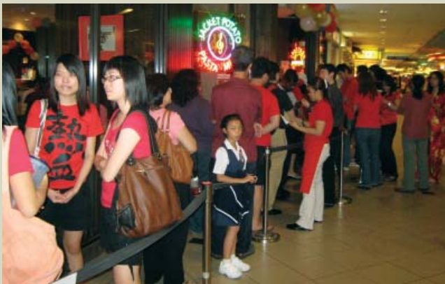
The queue for the RED – ROASTERS Eating Day celebration.

Kenny Rogers ROASTERS ("KRR") restaurants nationwide were swarmed with people in red on 13 January 2010 for the RED – ROASTERS Eating Day celebration. In conjunction with the celebration, KRR gave out a complimentary Kenny's Quarter Meal with any purchase of a Kenny's Quarter Meal to diners who came in with anything red on them. Diners were seen in bright red lipstick, red caps, red shirt, red shoes and even red pants!