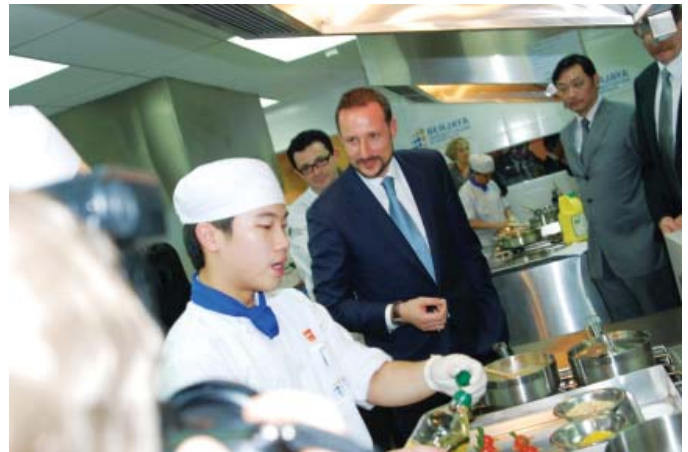
His Royal Highness Crown Prince Haakon of Norway exchanging a few words with one of the students.

After deliberating for more than 20 minutes on presentations from BERJAYA UCH and TAYLOR'S University College, the judges unanimously voted BERJAYA UCH as overall champions.