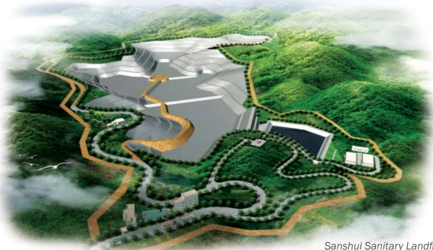
Sanshui Sanitary Landfill.

In July 2008, Berjaya Corporation Berhad ("BCorp") was awarded the "Foshan City Sanshui District Bainikeng Sanitary Landfill Project" under a "Build-Operate-Transfer" ("BOT") concept by the Construction Bureau of Sanshui District, Foshan City, Guangdong Province. In compliance with the Chinese Authorities' approval requirements and to facilitate project implementation, a locally incorporated subsidiary company, 100% wholly-owned by BCorp with the name of Berjaya Environmental Engineering (Foshan) Co. Ltd. was set-up on 14 January 2009. This local company was granted the rights to build, operate and maintain the landfill for a concession period of 28 years and thereafter transfer it back to the Sanshui Government at no extra cost.