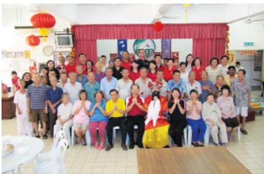
Residents of the Home and KRR's Support Center staff.

On 23 February 2010, more than 20 Kenny Rogers ROASTERS' Support Center staff brought smiles to the residents of Rumah Orang Tua Ampang in conjunction with the Chinese New Year. Residents were treated to Kenny's Quarter Meals and a "lou sang" session. They also received 'ang pows' from the "God of Prosperity".