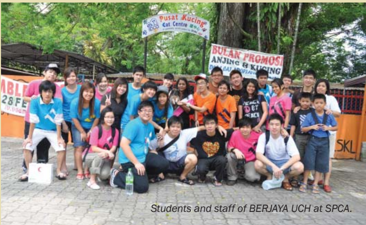
Students and staff of BERJAYA UCH at SPCA.

30 students and staff of BERJAYA University College of Hospitality (BERJAYA UCH) opened their hearts to the animals housed at the Society for the Prevention of Cruelty to Animals (SPCA) shelter in Selangor on 4 March 2010 as part of BERJAYA UCH's Corporate Social Responsibility (CSR) project.