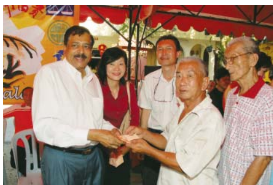
Y.B. Senator Dato' G. Palanivel presenting ang pows to senior citizens in Kuala Kubu Bharu.