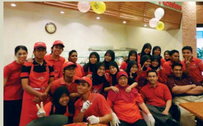
KRR Subang Parade team members clad in red.