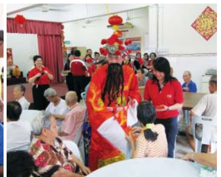
'Ang pows' from the "God of Prosperity".