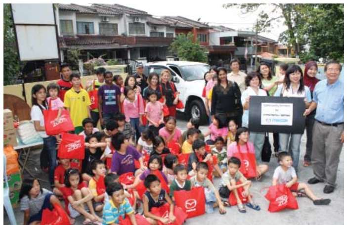
The children from Sunbeams with their 'ang pows' and goodie bags.