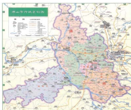
Map of Foshan City (Artist Impression).

The total investment cost for the project was RMB 263.9 million and the initial paid-up capital for the project company was RMB 35.6 million.