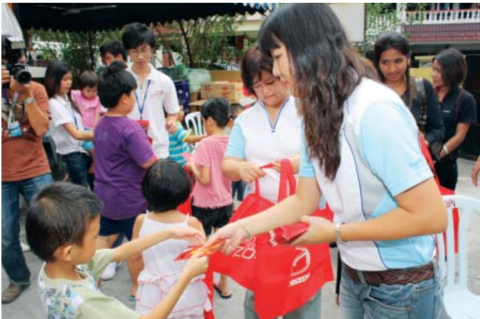
The children receiving 'ang pows'.

The children enjoyed a sumptuous Papa John's Pizza lunch and