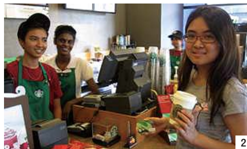
2 & 3. Loyal customers showing their Starbucks Card to redeem the anniversary coffee treat.