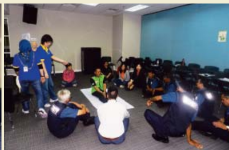
CPR and First Aid Training for Berjaya Group employees.