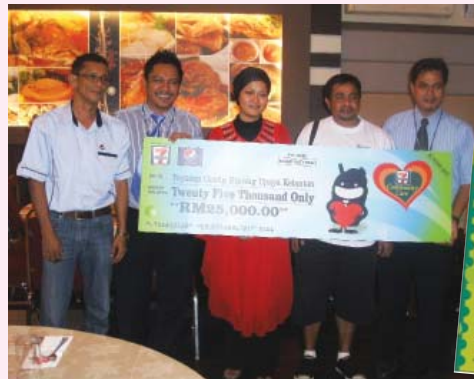
Managers from 7-Eleven & Permais Sandilands Kelantan presenting a contribution to YOKUK.