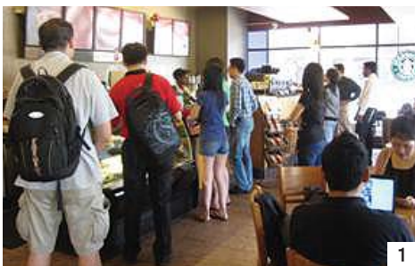
1. Customers queuing up for their aromatic cup of freshly brewed coffee.

The response was overwhelming as Starbucks Malaysia gave away a total of 12,532 cups of freshly brewed coffee in merely 2 hours. Loyal Starbucks’ customers have more reason to cheer now for next year’s anniversary celebration.