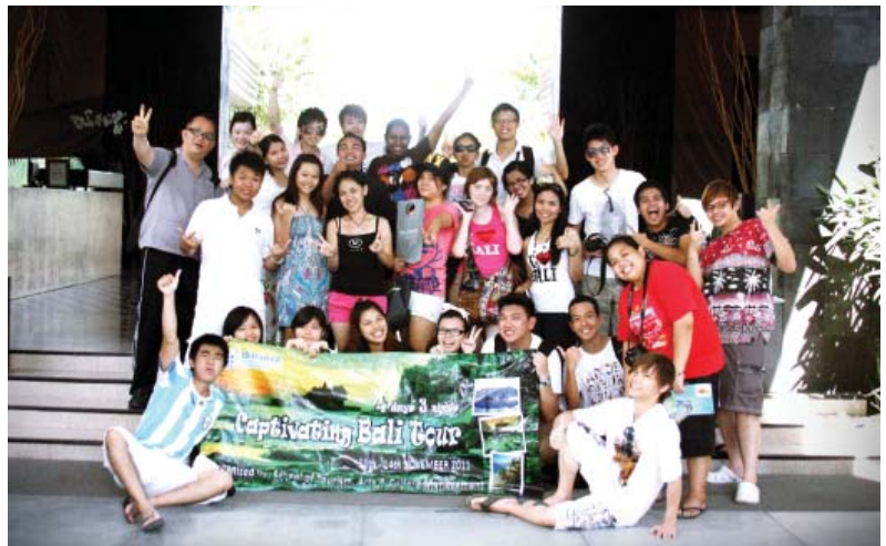
Students with happy faces in a group picture of the Bali tour.

The students visited the famous tourist attractions in Bali such as Kintamani for volcano viewing, Ubud, the royal ancient city, Tampak Siring and Tirta Empul, the holy spring water temples, Lake Bratan and Tanah Lot Sea Temple, one of Bali's most important sea temples which has a spectacular sight during sunset. Besides sightseeing, the students also conducted a hotel inspection during the trip which made the whole excursion a fruitful one.