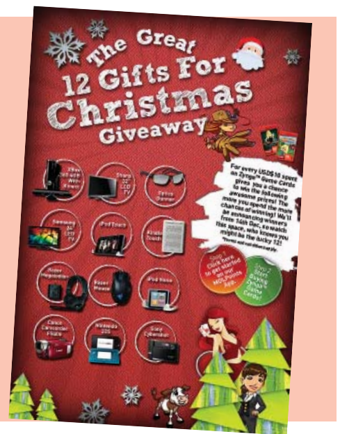
Posters of the 12 Gifts Christmas Giveaway and Zynga Game Cards Giveaway

The 2nd campaign, The Great 12 Gifts For Christmas Giveaway, was held from 1 December to 25 December 2011. For every USD$10 spent on Zynga Game Cards, members were entitled to win prizes such as a Xbox 360, Sony Cybershot and even a Samsung LED television. The campaign was held in all six Asian countries that MOL Global operates in. Everyday from 14 December to Christmas Day, a lucky winner walked away with one of the 12 fantastic prizes.