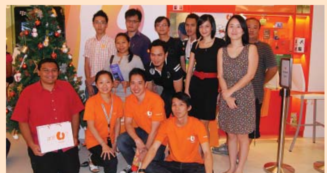
U Mobile's management and staff posing together with guests who attended the Christmas party.

On 5 December 2011, U Mobile held a Christmas celebration with its loyal customers in Berjaya Times Square. In conjunction with the celebration, U Mobile launched the latest gadgets, Blackberry Bold 9790 and Samsung GALAXY Tab 7 Plus and GALAXY W and introduced new Supplementary Lines for its postpaid customers, the most affordable rates in the market for data usage with free calls and free SMS.