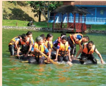
All were in high spirits to beat the wet challenge.

On 12 October 2011, Kenny Rogers ROASTERS organized some team building activities in a fun and “wet” way for more than 200 staff from all levels who got together to compete for the title of champion team at Nur Lembah Pangsun, Hulu Langat.