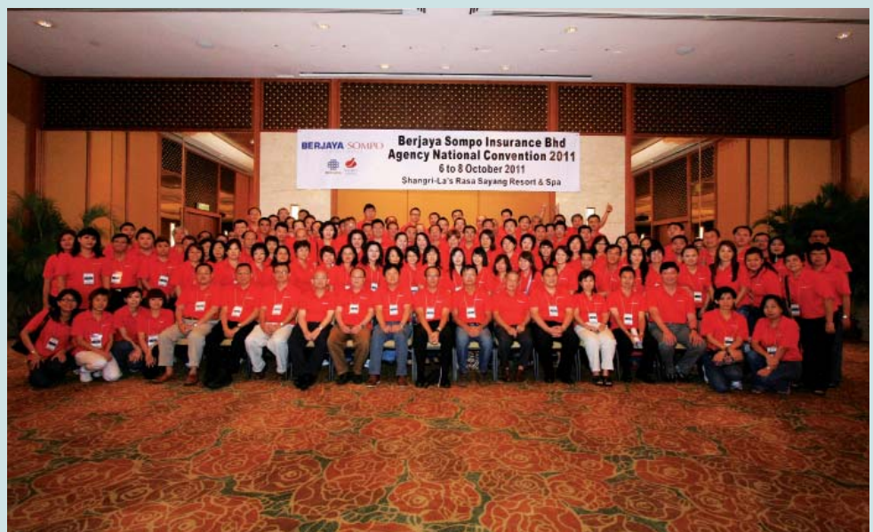
A big gathering for Berjaya Sampo Insurance at the 7th National Agency Convention in Penang.