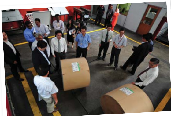
Viewing of the paper rolls used for newspaper printing.