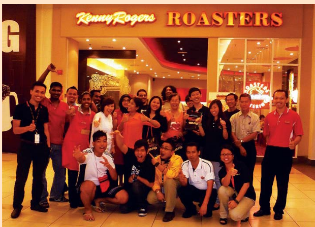
Lucky winners who joined the Spot & Dine programme by Traxx FM had a good time with Traxx FM's crew members and KRR's staff.

Twenty lucky Traxx FM listeners from the Spot & Dine programme were rewarded with complimentary meals when they were spotted by any one of crew members of Traxx FM at the KRR restaurant in Tropicana City Mall. The lucky winners were treated with Mexicano Baked Fish and Chicken & Pasta Meal on 3 October and 14 December 2011, respectively.