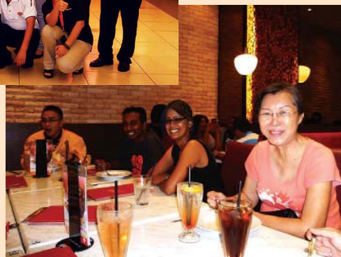
The winners enjoyed a delicious and wholesome meal at the KRR restaurant in Tropicana City Mall.