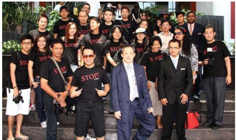
3,2,1-Stop! @BHR group photo of staff at Berjaya Penang Hotel.