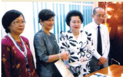
MOU signing with Negeri Sembilan Chinese Maternity Hospital.

On 2 December 2011, BCNHS signed a MOU with Negeri Sembilan Chinese Maternity Hospital which provide clinical placement for the students.