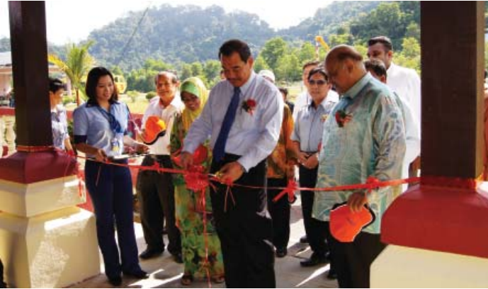
Dato' Seri Kong Cho Ha, Transport Minister, officiating the ceremony for re-activation of flights to Pangkor.