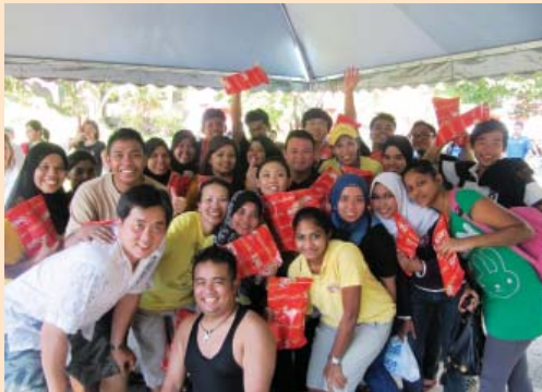
ROASTERS Day Out! A perfect get together for all KRR staff.