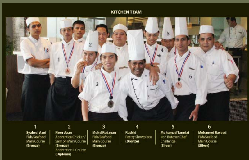
The winning team of BTS Hotel.

A total of 1 Gold, 7 Silver and 5 Bronze medalists