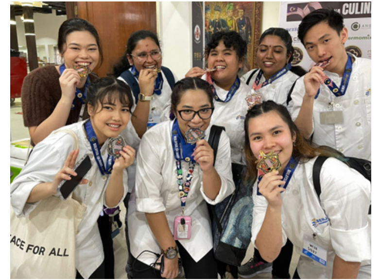
The taste of success! Berjaya UC culinary champions with their medals at the Malaysia Culinary World Cup

BERJAYA University College is committed to providing students with a stellar career in the prestigious world of gastronomy. Enrolling at Malaysia's top culinary school and pursuing a career in the culinary arts can lead to a rewarding career.