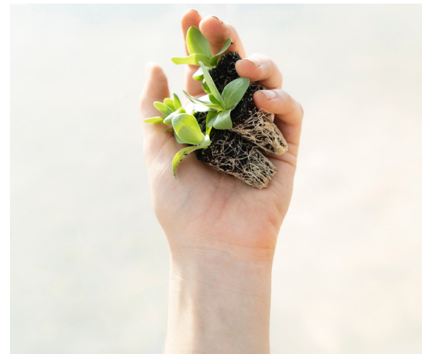
PG 38: News on Sustainability