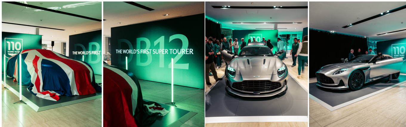
Aston Martin's latest model, DB12 captivated the crowd.

Drinks and canapes were served as guests and customers set their sights on the latest Aston Martin model for the official unveiling.