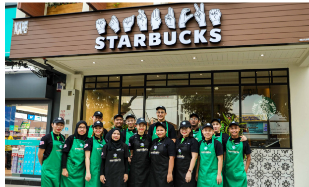
Starbucks Malaysia employees at their Starbucks Signing Store in Penang.

Besides, transparent communication is also key to attracting top diverse talent. We clearly communicate our commitment to diversity and inclusion through internal and external channels, sharing success stories, initiatives, and any recognition we receive for our efforts. This helps build trust and establishes Berjaya Group as an attractive option for diverse top talents.