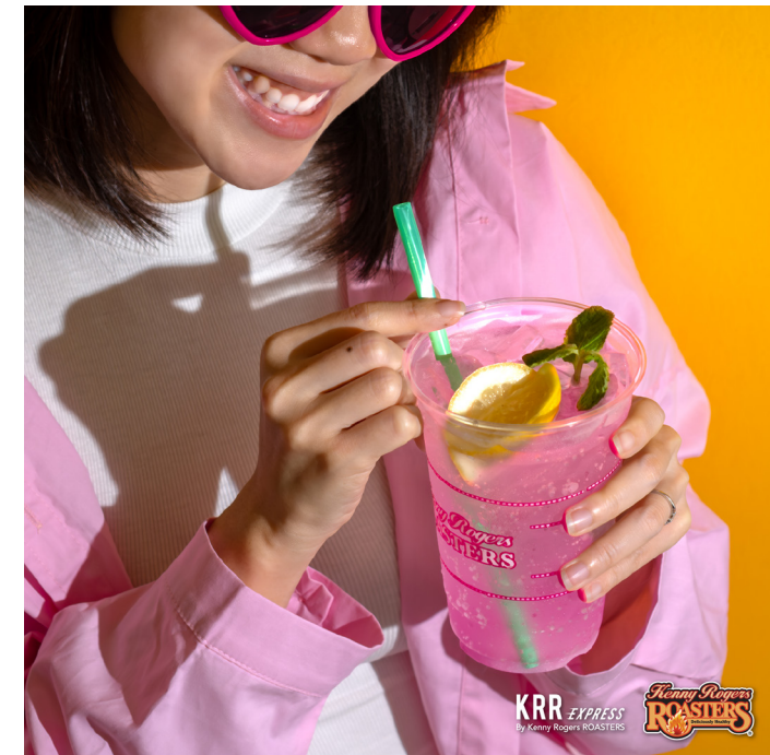
Lifestyle Lychee Lemonade Bliss

Come indulge in the tempting flavour while quenching your thirst.