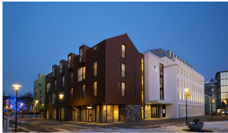
Iceland Parliament Hotel - Curio collection by Hilton situated at Rejavik.

Within the hotel, guest can indulge themselves in local delicacies with an international twist at the Hjá Jóni Restaurant or unwind with refreshing beverages at the Telebar. The Parliament Spa at the hotel provides guests with a chance to rejuvenate and relax, while the fully-equipped fitness centre is available for fitness-focused guests.