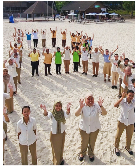
Berjaya Langkawi's female staff posing for a group photo.

ANSA Hotel Kuala Lumpur recently surprised its guests by introducing two cutting-edge robots offering complimentary bottled juices, snacks, and gelatos while filling the hotel lobby with melodic tunes, spreading joy and enhancing the overall ambience.