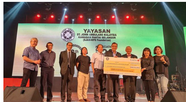
Beneficiaries receiving oxygen concentrators from CARiNG Pharmacy.