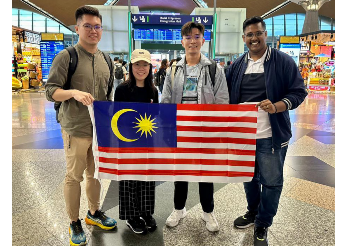
PG 25: News from Services segment