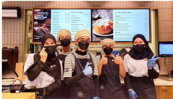
The Paris Baguette Malaysia team at their Pavillion KL location.

relationships with an increasing diverse regional, national, and global customer base. It is vital for us to understand and meet the evolving needs of our current and future employees and customers to thrive in a complex and rapidly changing business landscape.