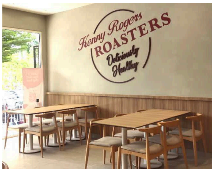
A cosy ambience at a KRR outlet.