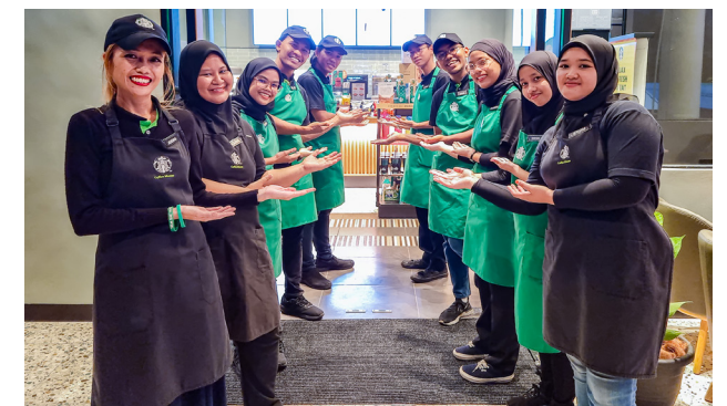
Happy staff from Starbucks Malaysia smiling for a photo.

VC: I envision our organisation, a Global Consumer Group, becoming an industry leader by forging enduring, long-term professional