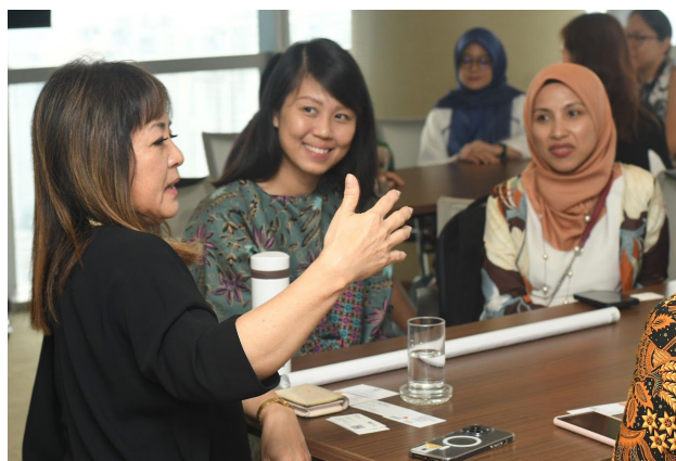
Listening to and receiving guidance from industry experts and mentors.