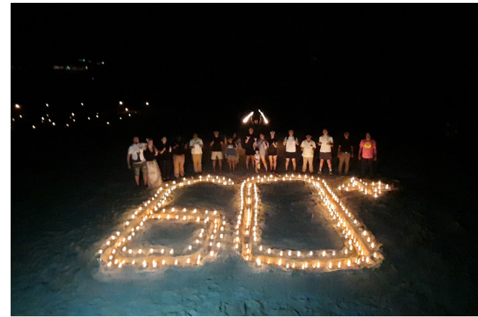
Berjaya Langkawi Resort Staff and in-house guests lit up candles at the beach area, in support of Earth Hour.

In conjunction with Earth Day, Berjaya Langkawi Resort went dark in response to the annual Earth Hour by switching off non-essential lights for an hour from 8:30 PM to 9:30 PM. To represent the collective commitment towards conserving energy and preserving our planet, both the resort staff and in-house guests took part in lighting up candles at the lobby and beach area.