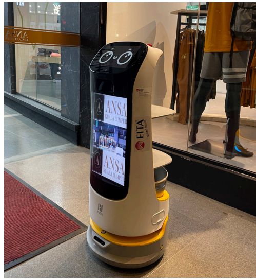
Melodic robot delighted guests at ANSA Hotel Kuala Lumpur.