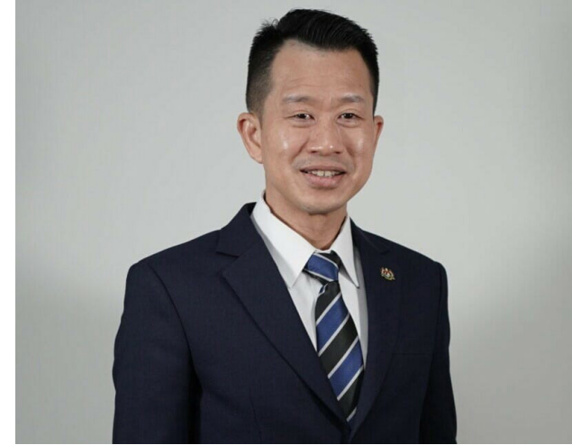
PG 19: News from Hospitality segment