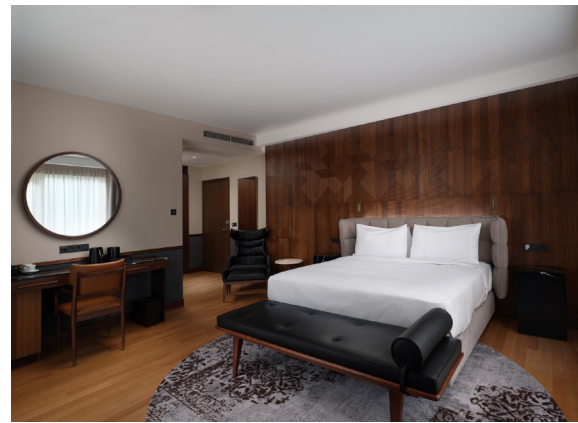
King Junior Suite at the Iceland Parliament Hotel.