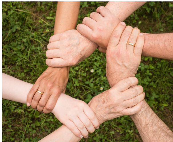
PG 30: News on CSR Initiatives