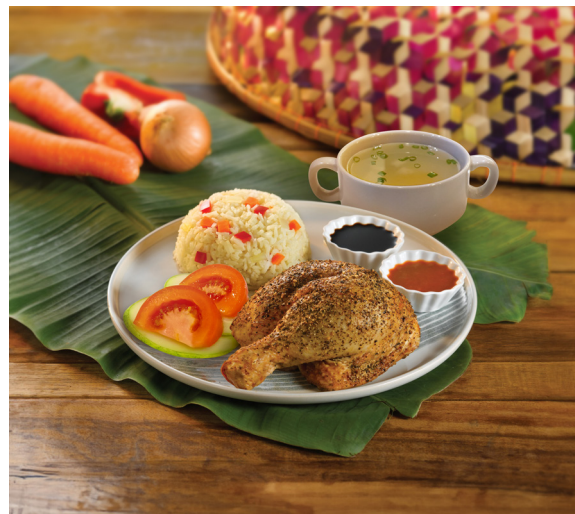
Kenny's Chicken Rice

There are several varieties available, including Chicken Rice Solo for a single serving, Chicken Rice Double for a larger portion, and Quarter Chicken Rice.