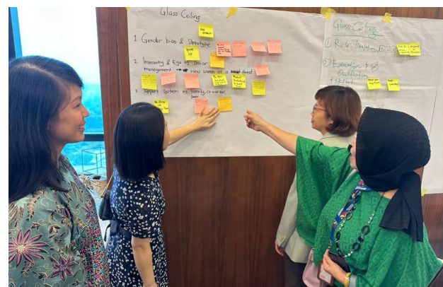
Group HR management brainstorming on Women Empowerment.

The diversity within Berjaya's workforce brings forth a multitude of perspectives and problem-solving approaches. By nurturing an inclusive environment that values and embraces different viewpoints, Berjaya taps into a rich pool of insights and experiences.