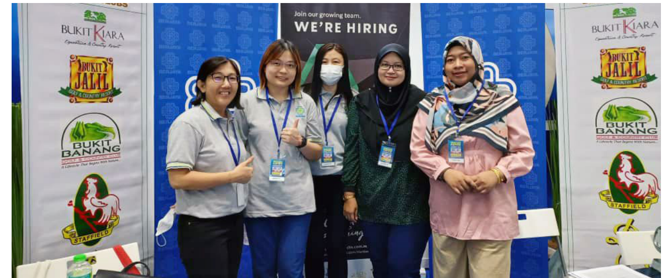
Looking for talents - Group HR recruitment team at the Graduan Career Fair.

DEI enables Berjaya to reduce its environmental impact. With a diverse workforce, Berjaya is more likely to have employees who are conscious of sustainability. These employees are inclined to make environmentally friendly decisions, such as adopting energy and water conservation practices, contributing to Berjaya's overall sustainability efforts.