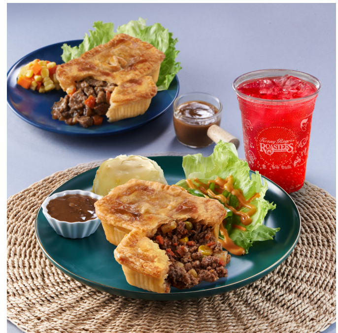
Kenny Rogers Roasters' Beef Steak & Mushroom Pie Meal

The Pie Meal is the ultimate blend of delicious ingredients and delectable pastry. The pies can be ordered separately as an a la carte item.