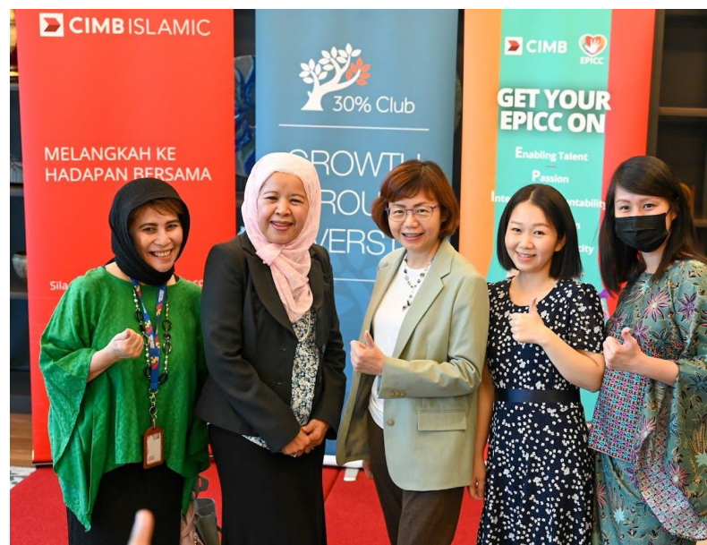
BCorp female management at the Speed Mentoring session titled, "Glass Ceilings or Sticky Floors - What's Holding Back" organised by the 30% Club Malaysia.

I am confident that we will unlock new opportunities, mitigate risks, and position Berjaya as an industry leader renowned for its long-term relationships, adaptability, and commitment to meeting the diverse needs of our stakeholders.