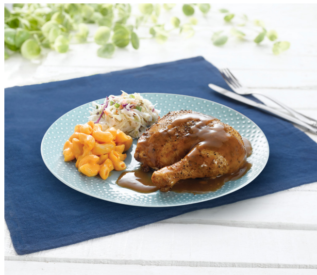
Kenny's Quarter Lite Meal

The latest offer provides outstanding value without sacrificing quality at an affordable price.