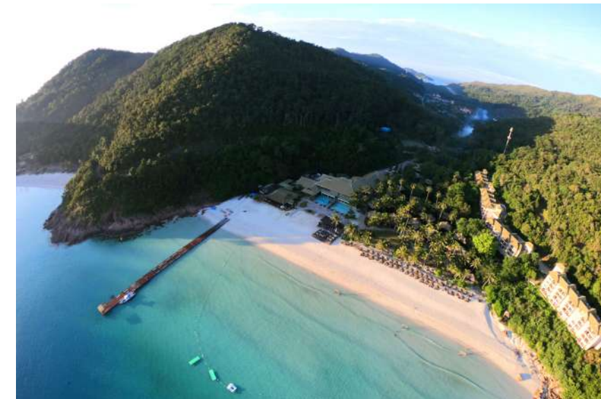
Clockwise: Cosway Experience Centre at Berjaya Times Square, Kuala Lumpur, aerial view of The Taaras Beach & Spa Resort and freshly brewed coffee from Starbucks.

have done right and continue the momentum. The Group will prioritise investment in its core business segments, while continuing to explore and invest in business opportunities around the region and globally. This strategy will foster business strength and growth as well as bring consistency to shareholder returns.