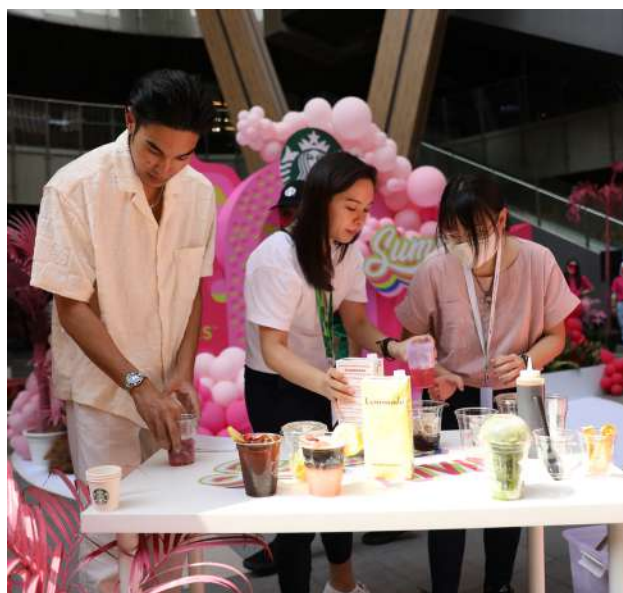
Members of the media playing mixology game

To introduce the all-new Starbucks Refreshers™, Starbucks Malaysia invited members of the media and lifestyle content creators to the Picnic in Paradise: Starbucks Refreshers™ Media Launch event. All-decked in pink, the picnic-themed media event took over the main outdoor area of the new LaLaport Bukit Bintang City Center mall. Partners and guests were all dressed up in pink with funky accessories, adding more bold summer vibes to the event.