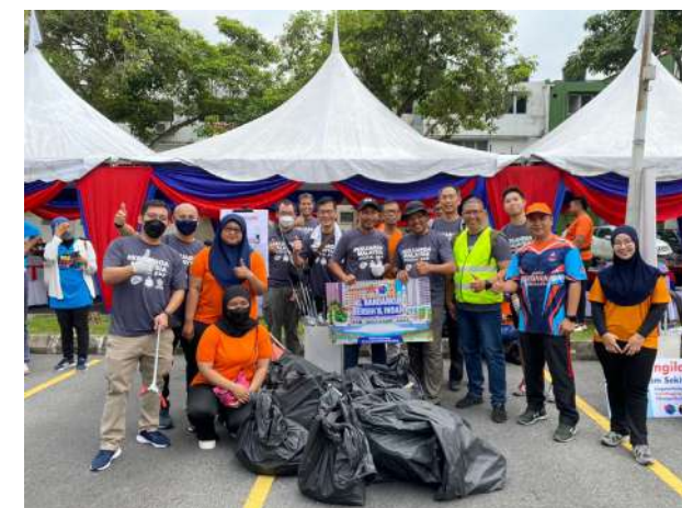
Group photo of Berjaya EnviroParks and Berjaya Corp, DBKL, UPM and others

DBKL signed a Memorandum of Understanding (MOU) with Berjaya EnviroParks Sdn Bhd in a ceremony held on 9 August 2022. Throughout this 12-month collaboration, Berjaya EnviroParks Sdn Bhd will assist by providing incentives and commitment for environmental programmes run by DBKL such as the 1 Community 1 Recycle (1C1R) programme.