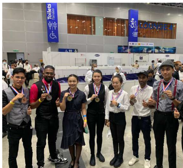
Participating students at the Battle of the Chefs 2022