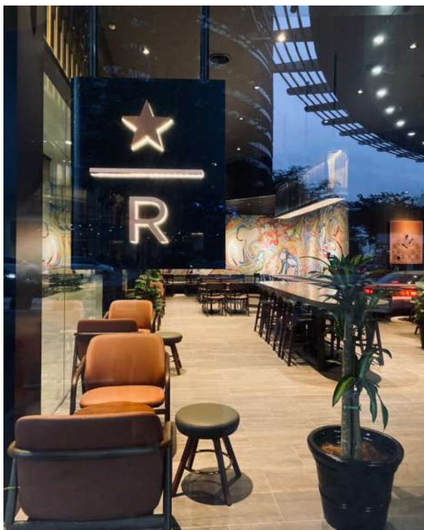
The newly opened Reserve store is decorated with a wall of art, featuring exotic animals from around the world.

In April, Starbucks Malaysia brought her out to the Sepang International Circuit and provided her the one-in-a-lifetime opportunity to drive a stock car on the circuit itself. She relayed this experience as one of the most exciting and exhilarating opportunities in her life, and told her community that dreams do come true; and that they should shed their fears, and dream beyond.