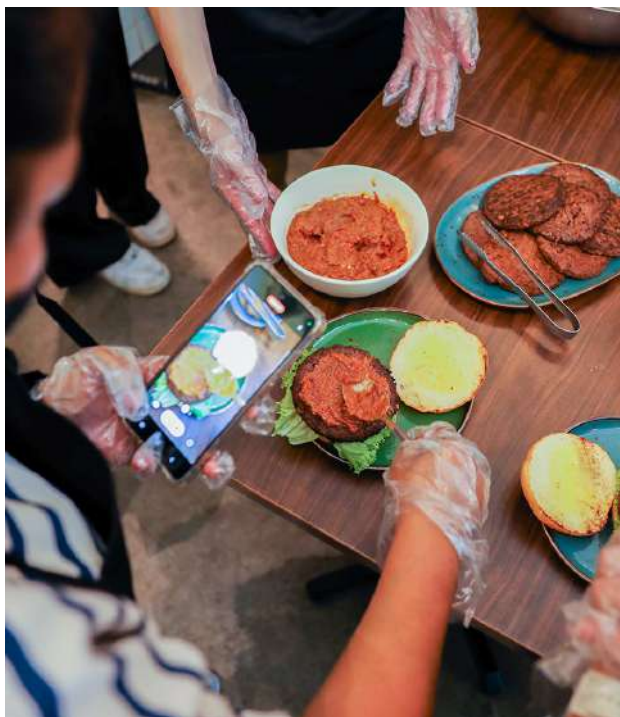
Members of the media were given a chance to stack their own burgers

At the launch event, members of the media were given a chance to stack their own burgers to truly appreciate the ingredients better before tasting the mouth-watering burger. Apart from the SALA's Burger Belacan, guests were served with popular SALA dishes such as Shrooms Asada and Spicy Asian Tofu burrito; Nasi Lemak Rendang; Pina Colada smoothies; and to sweeten the deal – Kelava handed out creamy and delightful flavours such as Vanilla and Ondeh-ondoh ice-cream. SALA also invited another strategic partner, Kimbo, to offer freshly-made coffee by their special barista.