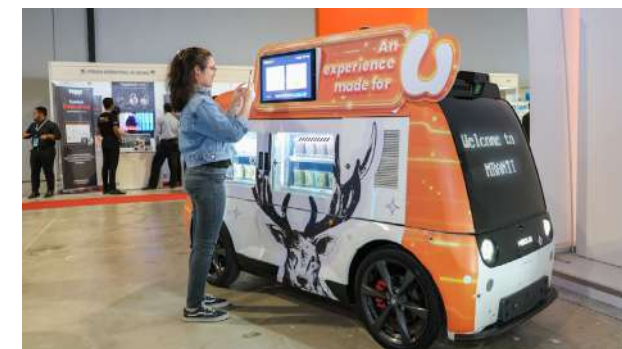
U Mobile recently showcased a preview of Smart Retail solutions being developed, such as the E-AGV (Electric-Autonomous Guided Vehicle) at Smart Nation Expo 2022.

U Mobile and Qualcomm, the world's leading wireless technology innovator, are collaborating to explore the future of Smart Retailing. This collaboration aims to enable digital innovations for retail players, enhancing the shopping experience for customers and simplifying operations for retailers in the process.