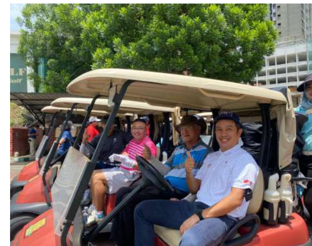
Members of the Bukit Jalil Golf and Country Resort

The game took place in the afternoon followed by the prize-giving ceremony and sumptuous dinner at the Golfer's Terrace. The Club has over 4,500 active memberships to-date.