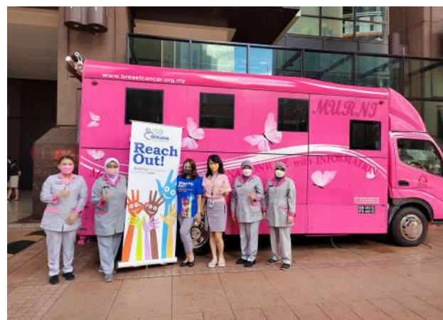
PINK MURNI Truck at the event site to conduct Clinical Breast Examination (“CBE”)

In conjunction with the Pink October month, Berjaya Cares Foundation in collaboration with the Breast Cancer Welfare Association (“BCWA”) organised an event to raise awareness among Berjaya employees and the general public on prevention and early detection of breast cancer on 22 September 2022 at Berjaya Times Square Kuala Lumpur.