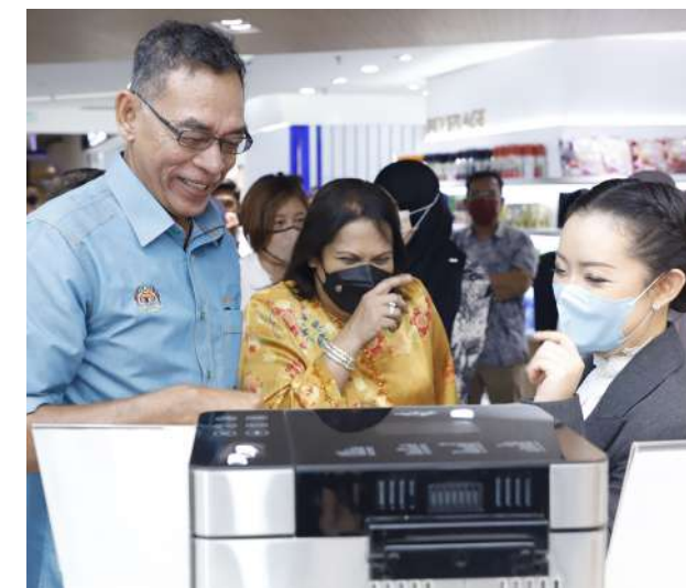
The Deputy Minister of Domestic Trade and Consumer Affairs, YB Dato' Raosol bin Wahid

The first Direct Selling Day Malaysia 2022 organised by the Ministry of Domestic Trade and Consumer Affairs (MDTCA) with the support of Direct Selling Association of Malaysia (DSAM) was held on 27 to 29 May 2022 at Berjaya Times Square.