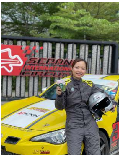
Zetty Nabila a Grande size Green Tea Frappe