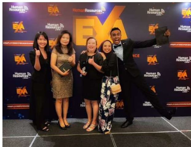
Starbucks Malaysia Human Resource team

APEA is a regional recognition programme for entrepreneurship and organisational excellence across Asia. APEA is awarded in honour of business leaders and enterprises that have shown outstanding performance and tenacity in developing successful businesses, whilst not neglecting their social responsibility. The team was also able to contribute around RM20,000 at the auction to Childfund Asia, to provide bicycles for children in rural settlements who struggle to reach their schools by foot.