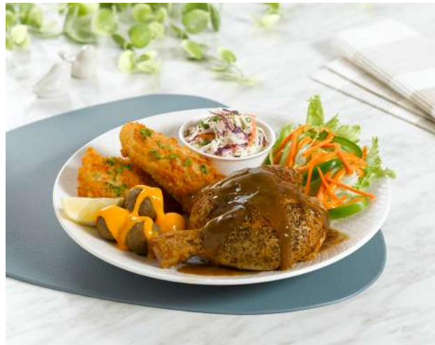
Kenny Rogers Roasters' Rotisserie-Roasted Chicken

Saudi Arabia, Macau and Hong Kong, just to name a few. Beyond that, we will also focus on cost efficiencies and identify new revenue streams through new business models and markets to further grow the business.