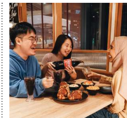
Kenny Rogers Roasters' Sate Krave Chicken