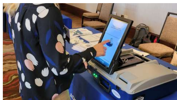
Unisyn's OpenElect® FVS in a demonstration at an election center conference in the U.S.

the Freedom Vote Tablet with internal battery (FVT-B). the FVS, along with the new ballot box, were used in the Callaway County, Missouri election in April 2022 and subsequently, in the election of other countries in Arizona, Iowa, Missouri, and Virginia. To date, more than 14,000 of Unisyn's OpenElect® voting systems and products have been installed and used in the elections of more than 250 countries in the United States.