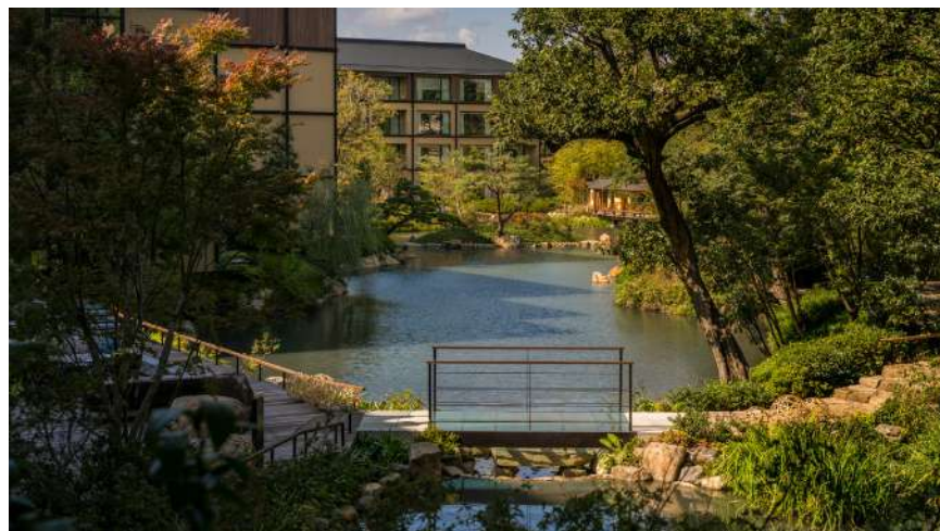
Four Seasons Hotel and Hotel Residences, Kyoto, Japan

Next year will see CFG entering into a collaboration to produce and market "Better-for-you" healthy gourmet product range under the brand "Vince Better Foods" for local and international markets. CFG also plans to widen