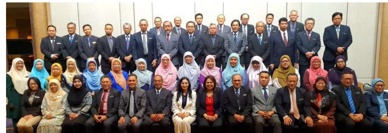
Photo session of the Delegates Of the Advanced Leadership and Management Programme (ALMP) with YB Senator Datuk Seri Zurainah Musa

During the session, YB Senator Datuk Seri Zurainah Musa provided suggestions and feedback to enhance the involvement of the private sector in various industries in line with the government's policies and economic strategies.