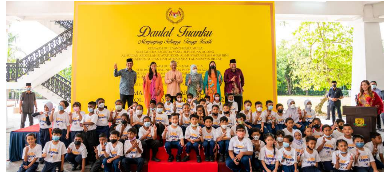
Datuk Nicol Ann David, His Majesty Seri Paduka Baginda The Yang Di-Pertuan Agong Al-Sultan Abdullah Ri'ayatuddin Al-Mustafa Billah Shah Ibnu Almarhum Sultan Haji Ahmad Shah Al-Musta'In Billah and Her Majesty Seri Paduka Baginda The Raja Permaisuri Agong Tunku Hajah Azizah Aminah Maimunah Iskandariah Binti Almarhum Al-Mutawakkil Alallah Sultan Iskandar Al-Haj.