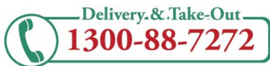
1. Papa John's, AEON Mahkota Cheras, Kuala Lumpur. 2. Papa John's, AEON Bandaraya Melaka.