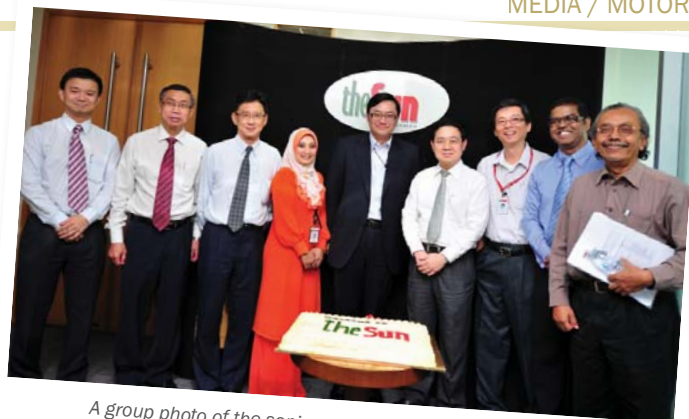
A group photo of the senior management & editorial team of theSun.