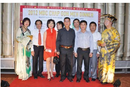
The team of SBBS celebrated the 15th day of Chinese Lunar New Year with authorities from the State Securities Commission, Ho Chi Minh Stock Exchange and Vietnam Securities Depository.

On 7 January 2012, Saigonbank Berjaya Securities (SBBS) co-organized a half-day investment seminar with Hong Leong Bank Vietnam on economic outlook and stock investment. The knowledge shared by the SBBS speakers was enlightening to clients from SBBS and Hong Leong Bank.