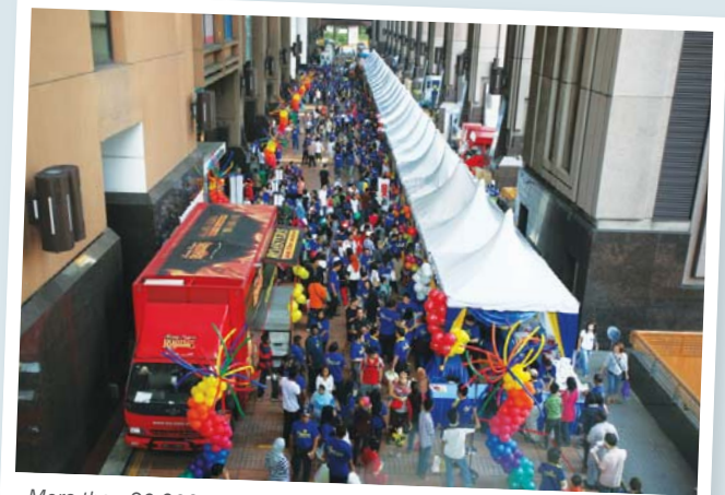
More than 20,000 Berjaya staff and their families enjoyed the carnival at Berjaya Times Square.