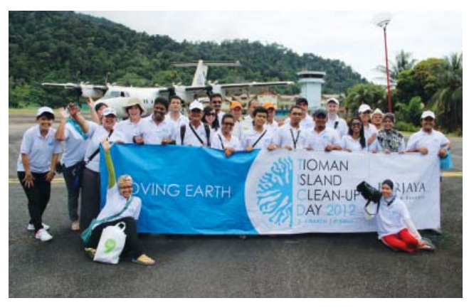
Berjaya Air staff and volunteers all geared up for Airport Cleaning Campaign.

Rescue Department, Immigration Department, Customs Department and Marine Park took part in Airport Cleaning Campaign hosted by Berjaya Air. This campaign includes airport cleaning exercise and "Foreign Object Debris" (FOD) sweep which is an aviation term used to describe debris on or around an aircraft which may cause damage to an aircraft.