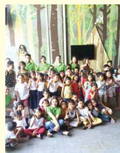
Staff of Beriava Makati Hotel and the children at the welfare centre of He Cares Foundation.

Besides the feeding programme, this visit to He Cares Foundation was also an occasion to spread love, togetherness and friendship while putting together a special lunch treat for the children as majority of the children were abandoned and are in need of