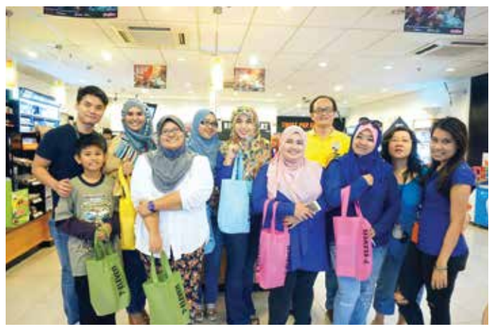
The team from 7-Eleven Malaysia and the bloggers during the 7-Eleven Bloggers Gathering in 7-Fleven Jalan Sultan Ismail.

The bloggers gave good feedback about the taste of each food presented. The reviews in their blogs will help bring more awareness and exposure to 7-Eleven's 'Fresh to Go' products.