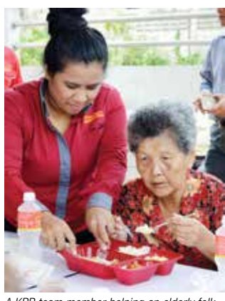
A KRR team member helping an elderly folk