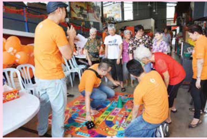
The U Mobile team playing Snakes & Ladders with the old folks.

On 26 January 2016, U Mobile's sales team and business partners volunteered their time at the Rumah Charis Welfare Home to share love and happiness with the children and senior citizens there. This was the team's second visit to the home since 2013 where they spent time with the residents and provided them with food, fun, lots of gifts and a whole lot of laughter.