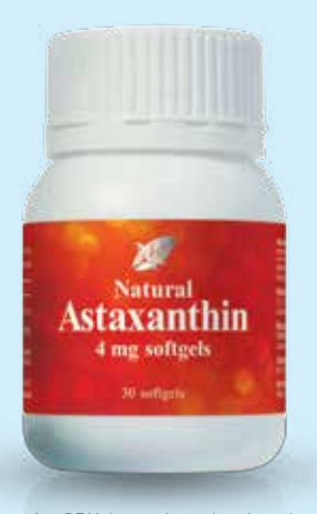
AstaREAL is a registered trademark of Fuji Chemical Industry Co... Ltd., Japan, the United States of America, Europe and/or other countries.