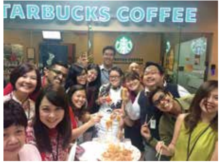
Starbucks partners tossing 'yee sang'.

It was a fun and memorable event for the partners where everyone shared their well wishes and blessings for a great year ahead.