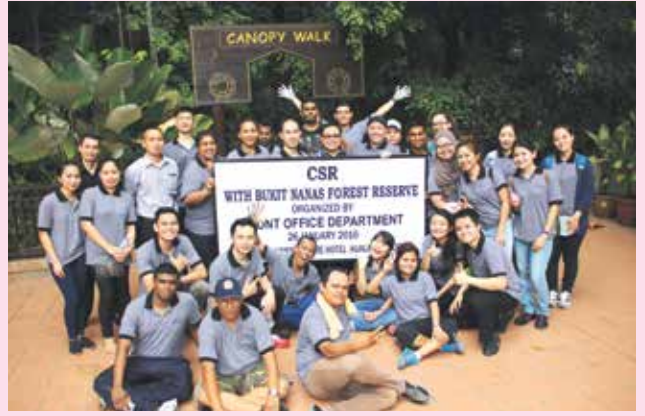
Group photo of Berjaya Times Square Hotel, Kuala Lumpur's volunteers during the CSR