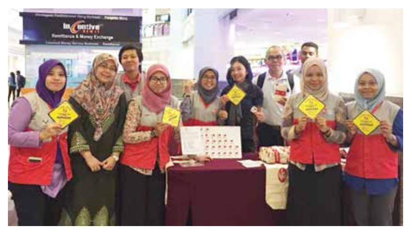
The team from the Public Education Department of NKF constantly reaches out to the public to educate them on the causes,

It was reported that the most common cause of kidney failure in the adult population in Malaysia is diabetes and nearly 60% of all new patients accepted for dialysis are diabetics. At present, there are about 30,000 people on dialysis and the number is increasing by about 5,000 to 6,000 each year.