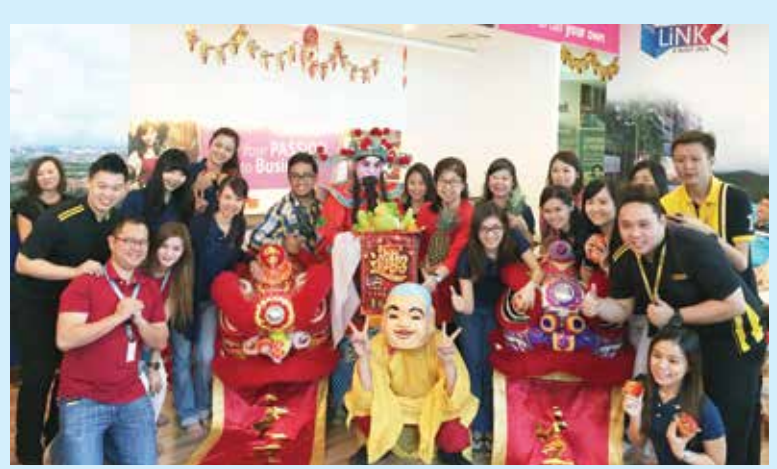
The Berjaya Golf Resort Berhad team with the lion dance performers.