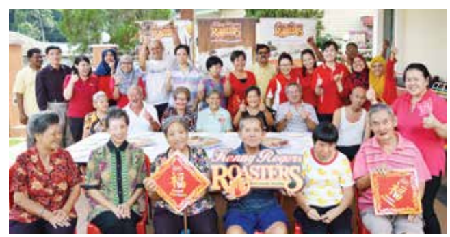
The KRR and Food Aid Foundation team with the residents of Tong Sim Senior Citizen Care Centre, Kampung Baru Salak Selatan.

As part of the Malaysian tradition during Chinese New Year, the KRR team incorporated a Yee Sang tossing during the event. Red packets and goodie bags with chicken essence and other healthy refreshments were also given to the residents of Tong Sim Senior Citizen Care Centre. The elderly folks and caretakers had KRR's latest T-Wrap Chicken Meal and hottled water.