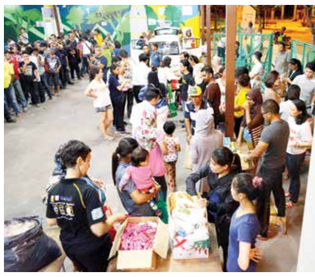
The 7-Eleven team and NGO Hub distributing food to the needy.

Serving to about 700 packets of food at Lorong Medan Tuanku 2 and PSK Kota Raya Service Point after working hours, the volunteers found the experience rewarding as it added meaning to sharing and caring for the underprivileged.