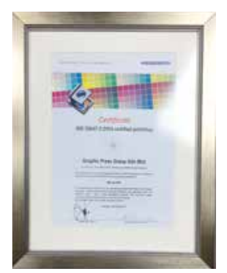
The ISO 12647-2 Certification .