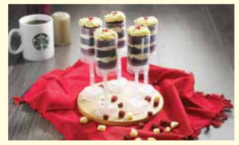
Starbucks Red Velvet Chocolate Popping Heart.