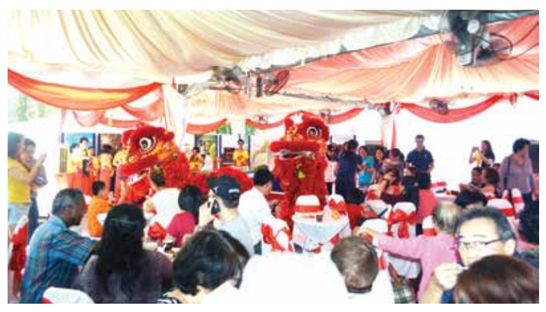
A lion dance performance entertaining the crowd.