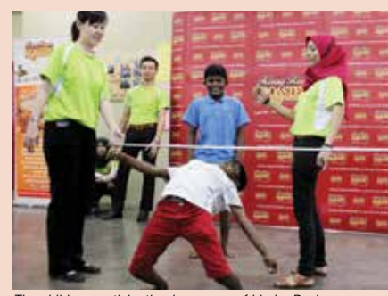
The children participating in a game of Limbo Rock.

In its 11th year running of the Wishing Tree campaign, KRR and their valued guests were able to fulfill more than 2,500 children's wishes this time.