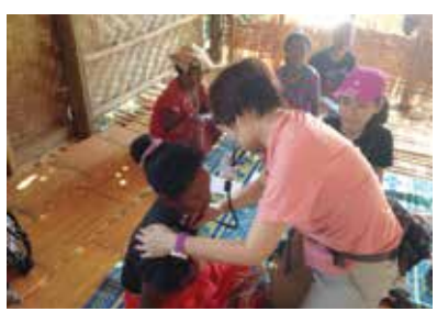
Doctors from the mobile clinic giving free consultation to the villagers.