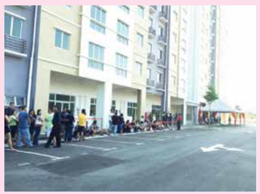
Registrants queuing to get hold of a unit.

Given the number of registrants that far outnumbered the 220 units available, all units were sold out before the preview weekend was over, clearly indicating that Akasia @ Berjaya Park, was a hit because it was sold as a fully completed property.