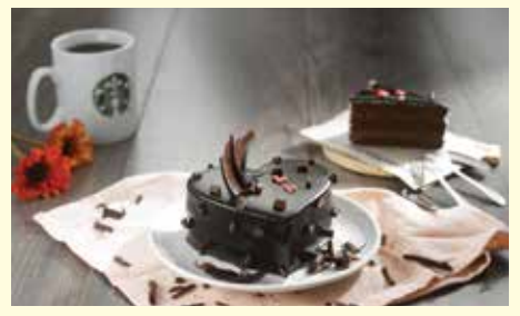
Starbucks Chocolate Noir Cake

The cakes were available from 10 February to 19 February 2016.