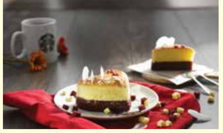
Starbucks Red Velvet Baked Cheese Cake