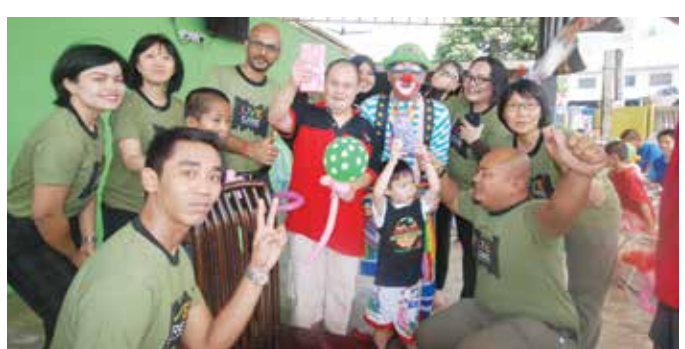
Residents of Pertubuhan Kebajikan Insan Istimewa Johor Bahru enjoying the Clown Show together with the staff from Berjaya Waterfront Hotel.

Pertubuhan Kebajikan Insan Istimewa Johor Bahru is a non-profit organisation established in May 2008, caring for 41 disabled aged from one year to 36 years old. The home adopts and takes care of physically handicapped and mentally retarded children suffering from conditions such as Down Syndrome, Slow Learner, Cerebral Palsy, Hyperactive, Autism, and Blindness.