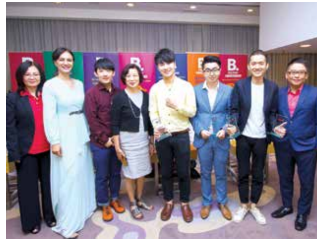
The panel of judges and winners at the press conference.