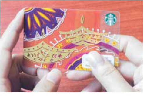
Starbucks Diwali card.