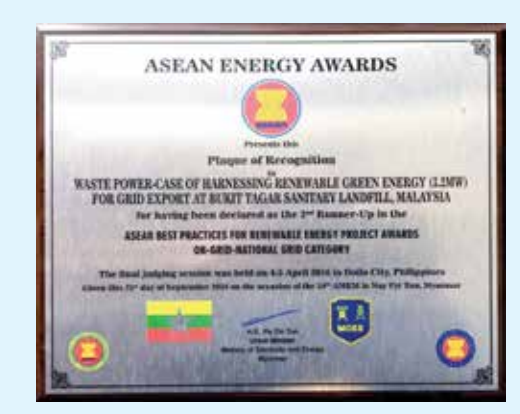
KUB won 2nd runner-up in the ASEAN Best Practices for Renewable Energy Project Awards On-Grid-National Grid category