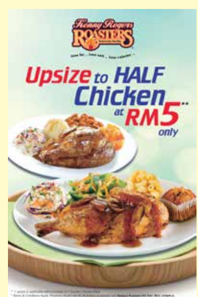
At Kenny Rogers BOASTERS, we want you to be healthy!

ROASTERS Kennv Rogers introduced the Absolutely Sambalicious flavour to the table in their latest promotion, offering guests a variety of Sambalicious meal options such as the Sambalicious Soup Meal, Sambalicious Favourite Meal and Sambalicious Chicken Meal, from RM19.90 onwards, with Potato Salad and Spicy Golden Rice side dishes are also available at an introductory price of RM5.90 each (Normal Price: RM8.50).