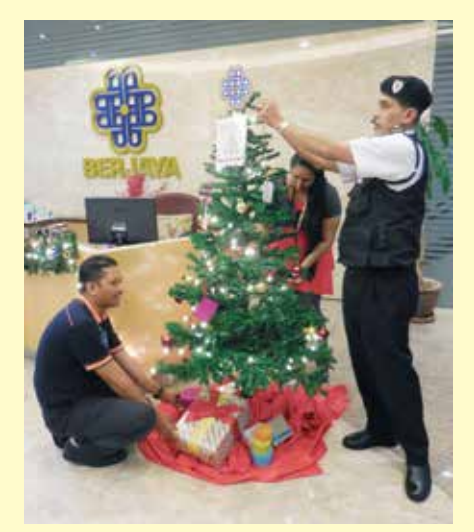
Employees decorating the East Wing Appreciation Tree with their wishing cards.