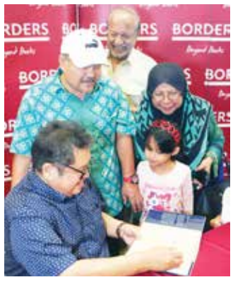
Book signing session with Datuk Lat.