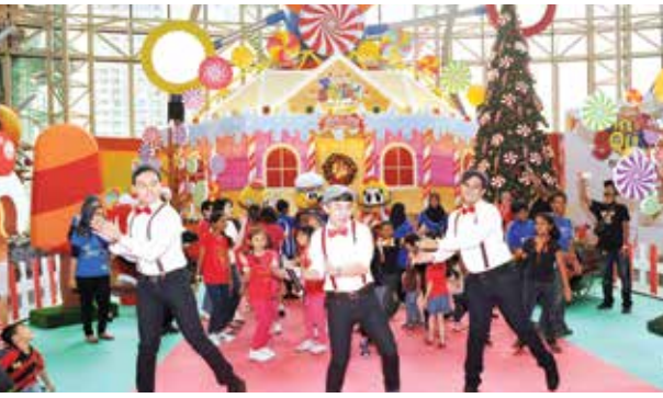
The children dancing along while having a good time at the Snow Fall show at the theme park.