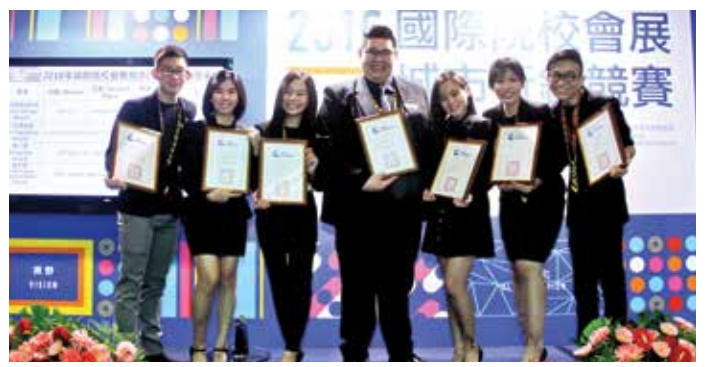
The BERJAYA UCH team swept away prizes at 2016 Taiwan MICE Challenge.

The event organised by the Taiwan External Trade Development Council was held at the world-renowned Taipei International Convention Centre from 6 - 8 September 2016 and attracted more than 2,000 visitors. A massive congratulations to BERJAYA UCH team!