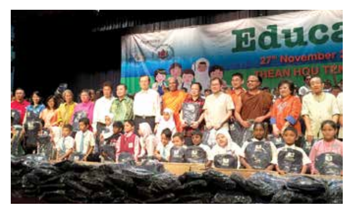
A group photo with the donors and recipients