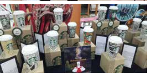
Some of the selected designs of the Starbucks x Citrawarna doodle contest on display at Malaysia Tourism Centre.