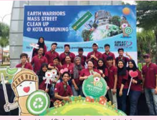
Group picture of Starbucks partners who participated for the Earth Warriors Mass Street Clean Up @ Kota Kemuning.