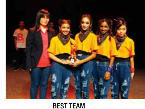
SMK (P) Methodist Klang These girls dominated the dance floor as a united team with their amazing routine.