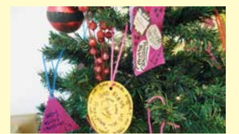
Employees' personalised wishing cards

encouraged to pen down their message(s) on wishing cards. These cards were then used to decorate the Christmas trees. It was a significant and heartwarming event as the employees came together to decorate the Christmas trees.