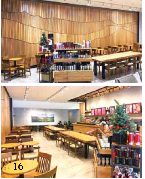
Part of the interior of Starbucks Design Village.