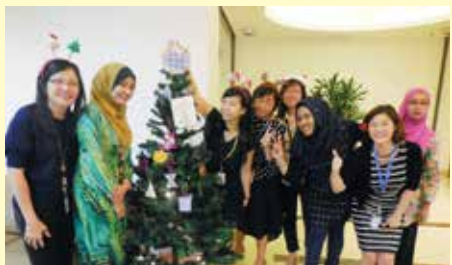
Group HR & Admin decorating the West Wing Appreciation Tree with their wishing cards.