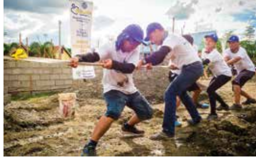
Combining their strength, Berjaya Philippines staff are in one direction in fulfilling their task.

The officials and staff of Berjaya Group Philippines joined the Gawad Kalinga Bayani Challenge 2016 as they helped mix cement and carried hollow blocks amidst the scorching heat of the sun to build 30 houses in said province.