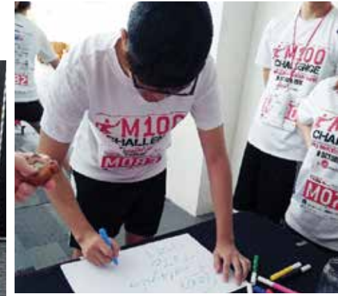
A Taylor's University student drawing a Berjaya company's logo.