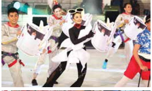
Performers holding cut-outs of the Starbucks Kuala Lumpur City Relief Mugs.

A Starbucks x Citrawarna doodle contest was held in conjunction with this event, aiming to encourage creativity through doodling by reusing Starbucks' paper cups. The contest duration was from 5-12 September and extended to 19 September due to overwhelming response. 10 winners with the most creative artwork won Starbucks hampers worth up to RM1,000 and a pair of VIP tickets to watch the Citrawarna showcase. Among 280 submissions, the best 40 designs were displayed at Malaysia Tourism Centre ("MaTiC").