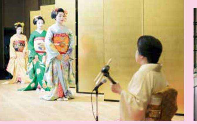
Some of the performances during the launch.