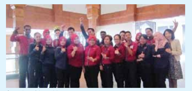
Group photo of the participants.