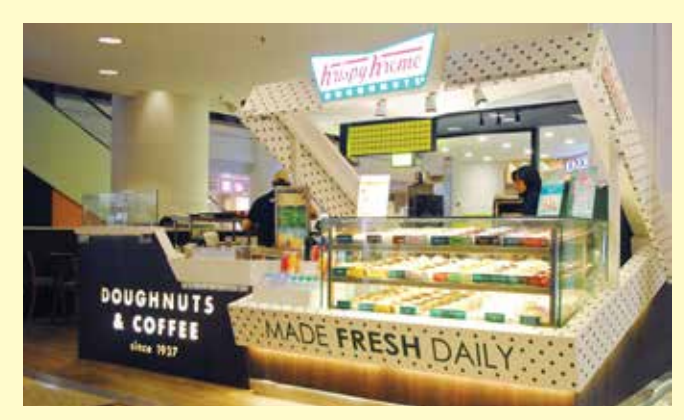
Berjaya Times Square outlet.

The newly relocated Krispy Kreme is found on the lower ground level at the West Wing of Berjaya Times Square.