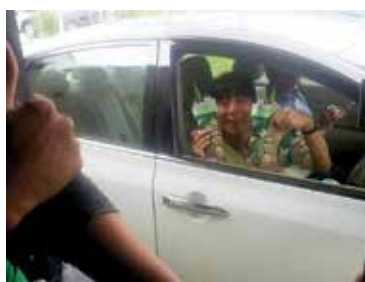
Produce harvested were shared with customers and residents of Kota Kemuning.

Starbucks partners with the produce they harvested.