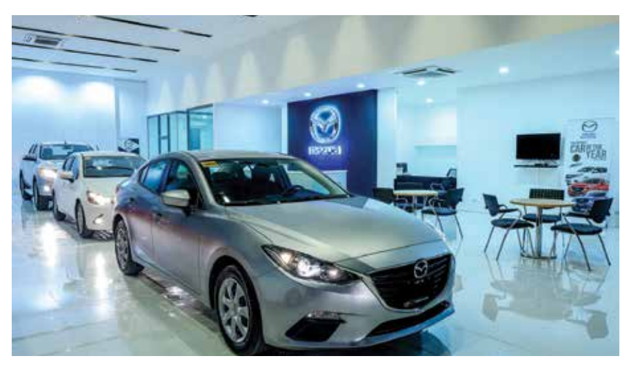
The interior of the showroom.

Bermaz Auto Philippines, the exclusive distributors of Mazda vehicles in the Philippines, along with Auto Zoom Zoom Incorporated, the same group that established Mazda Makati, Mazda Cavite, Mazda Sta. Rosa, and Mazda Iloilo, recently introduced the latest full-service dealership in the fast growing Mazda network, Mazda Negros.