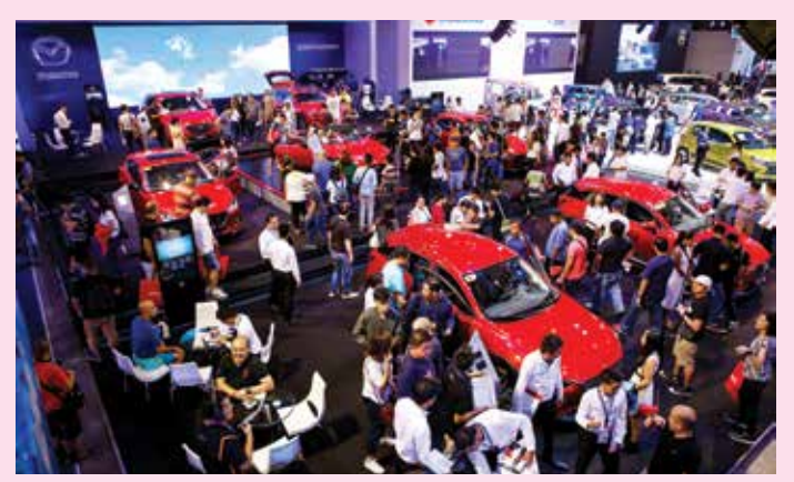
The crowd looking at Mazda vehicles at the motor show.

BAP also celebrated Mazda's 2016 J.D. Power Philippines CSI Study number one ranking at PIMS by recognising dealer principals who have been instrumental in elevating the standards of aftersales service in the Mazda network.