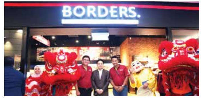
The lion dancers posing during the launching event.

Taking center stage in Borders Malaysia is its "Beyond Books" experience that encourages customers to browse books and magazines as much as they like in their favorite Borders store.