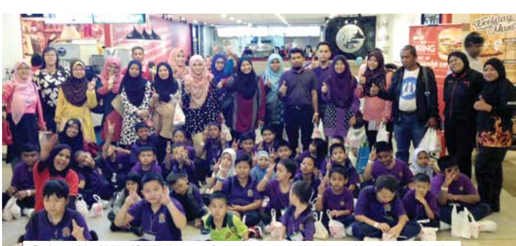
Teachers and the children of Sekolah Kebangsaan Puchong Utama and the Wendy's team after their lunch at Wendy's

It was all smiles and laughter for these children when they enjoyed a Frosty cone before leaving.