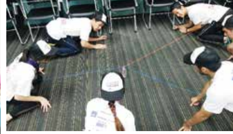
Students trying to get the magnets out of the bottle.