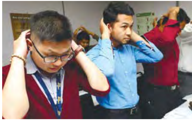
Tilting their heads forward to overcome strain at the neck after hours at their work stations.

Additionally, on May 2, a group of nurses from TDMC set up a booth at theSun and conducted free health screening services. Response was good as many employees queued up to get their glucose levels and blood pressure checked and general health examined. Those who went for the screening were given a RM50 medical gift voucher, courtesy of TDMC.