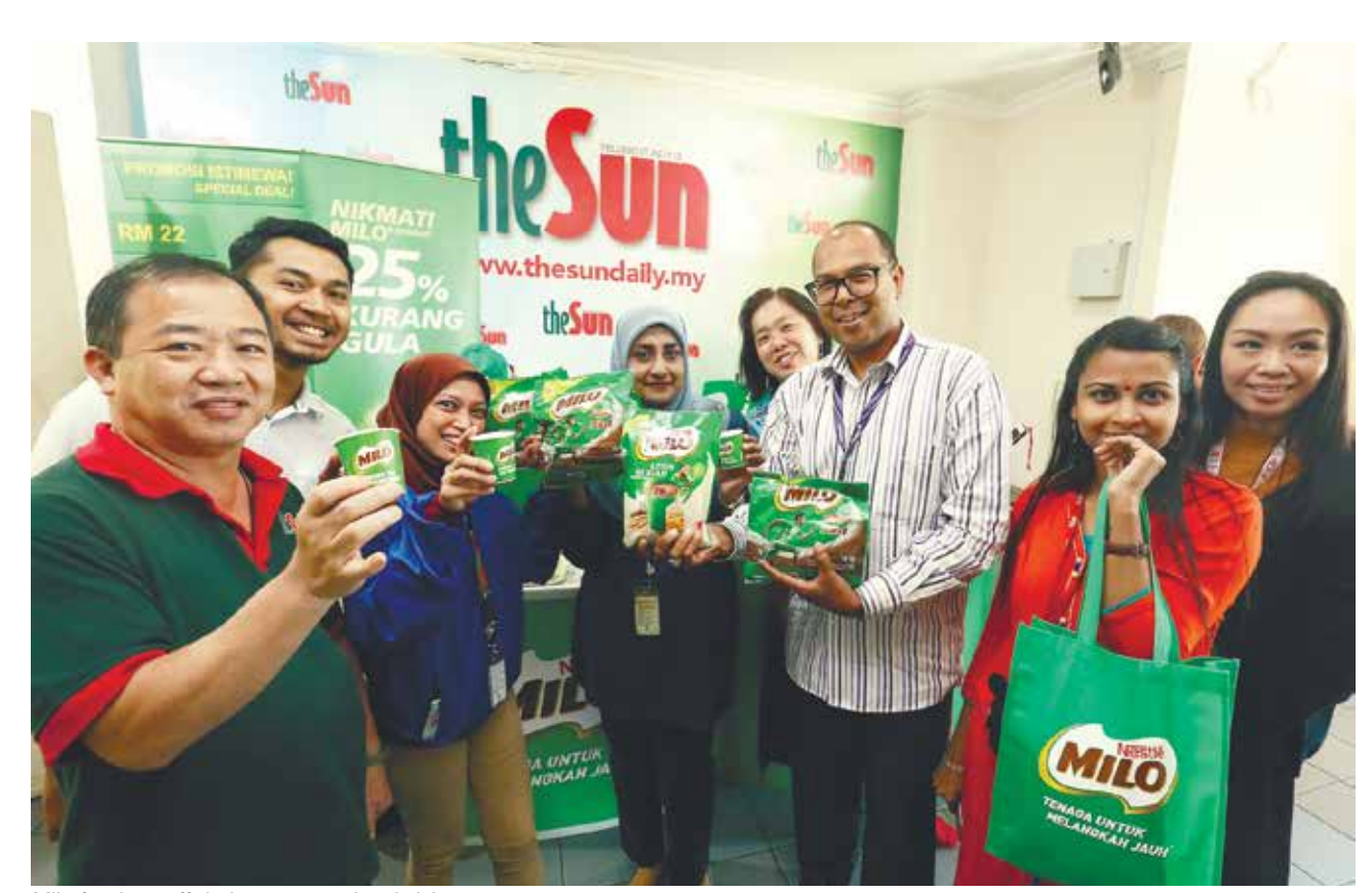
Milo for the staff during a promotional visit.