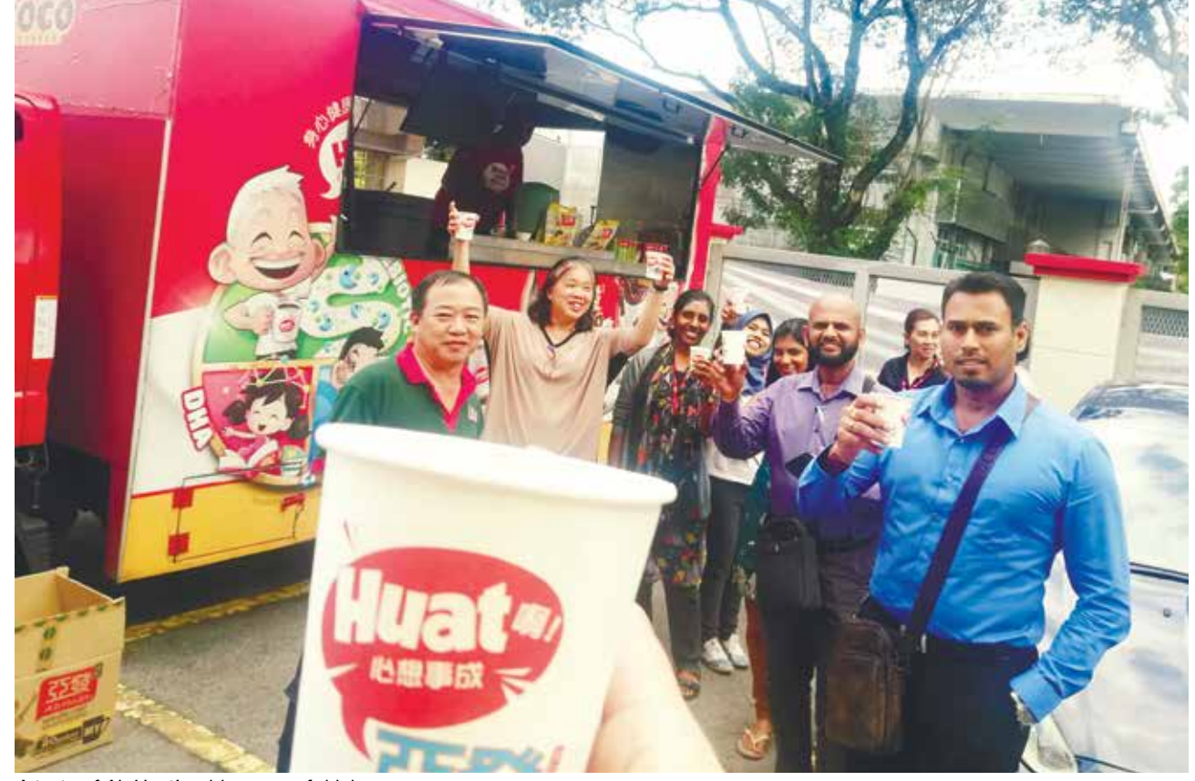
A taste of Ah Huat's wide range of drinks