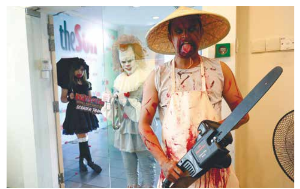
Ghouls and all things scary "invade" theSun during the promotional visit.