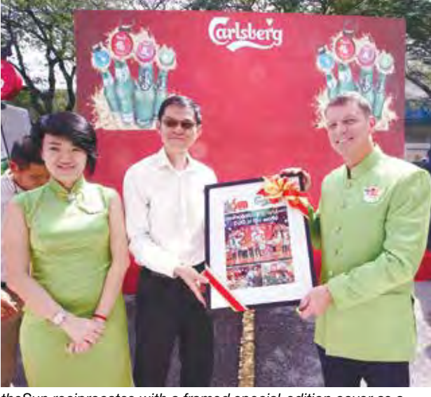
theSun reciprocates with a framed special-edition cover as a memento.

In keeping with the spirit of the celebration, the annual fun-filled reception at theSun office grounds, went into the afternoon and saw both theSun's and Carlsberg's personnel enjoying the "POP" and social interaction.