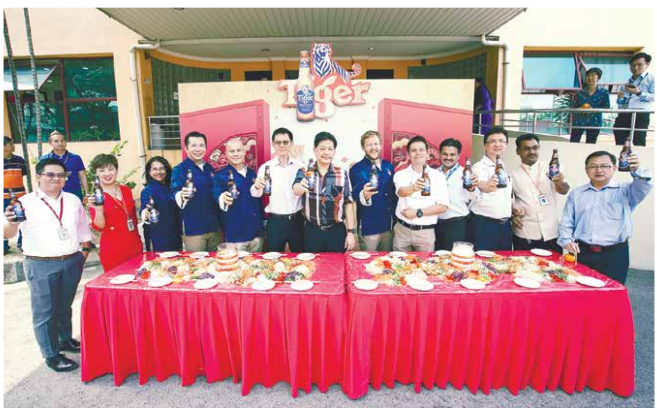
Key management staff of Heineken Malaysia and theSun toast to a good year with beer and yee sang

Once the formalities were over, the mingling and merriment continued. Heineken Malaysia personnel also took the opportunity to share about its CNY campaign where consumers who purchased any big bottle of Tiger Beer, Guinness Foreign Extra Stout or Heineken at participating F&B outlets could win prizes such as an ang pow worth RM88,888; exclusive Tiger Beer Mahjong sets; and exclusive Prosperity Bowl sets. The positive energy and festive spirit lasted well into the work day.