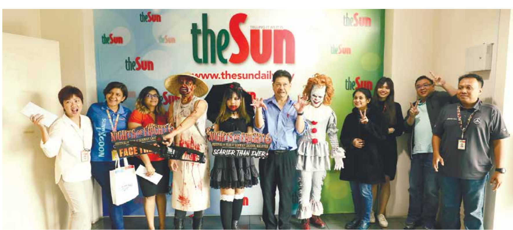
Members of theSun's editorial team find their match among Sunway Lagoon's group of "zombies".